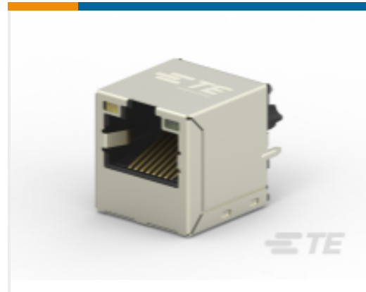
TE Part #5-2301995-3 RJ45 JACK INT.MAG. 10/100 LED 1X1 VERT.