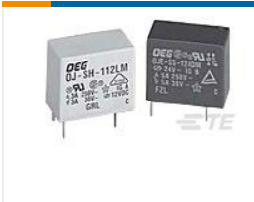
TE Part #2-1419129-1 OJ-SS-112LM,000