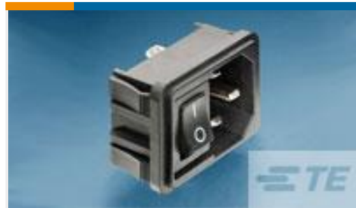
TE Part #1-1609112-3 15CBS1=F8273