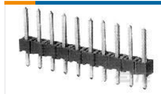
TE Part #825433-2 MOD 2 PINHDR 1X2 P.