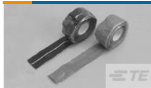
TE Part #1-608036-4 SILICONE FUSION TAPE,1"X15'