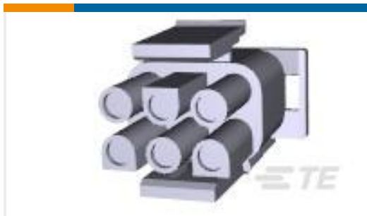
TE Part #1-480704-0 06P UMNL PLUG HSG NATL