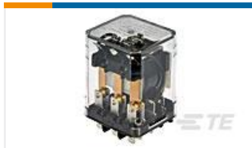
TE Part #1393118-2 KUP-14A55-24=KU