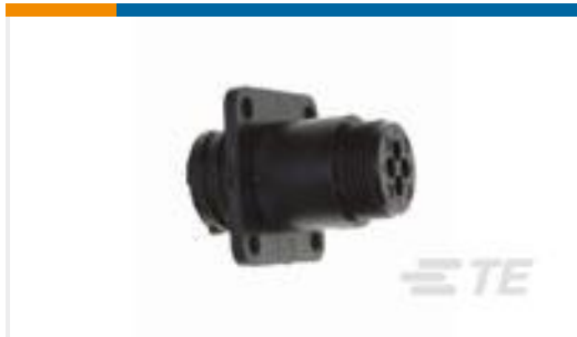
TE Part #206061-1 RECPT, SZ 11-4, CPC