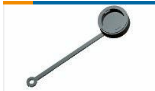
TE Part #206903-2 SEALING CAP ASSY,SZ 11,CPC