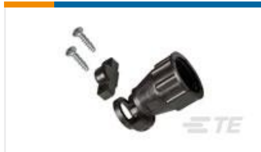
TE Part #1-206062-4 CABLE CLAMP KIT #11