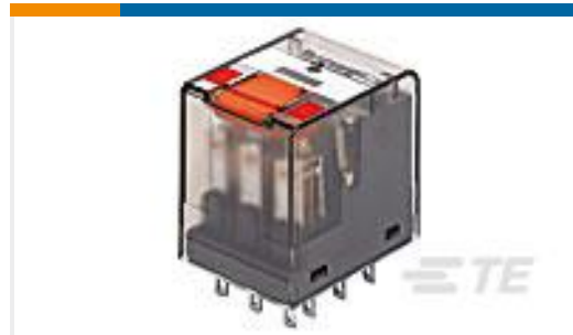
TE Part #1-1393154-2 PT570024