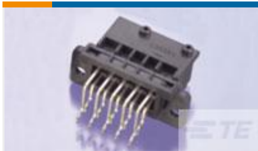
TE Part #1-963215-1 16P STIFTWANNE 3MM