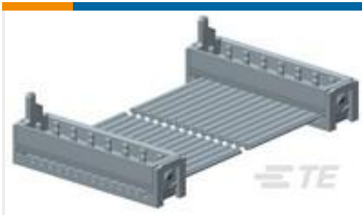
TE Part #1483355-1 MICRO-MATCH LEAD 14P 100MM