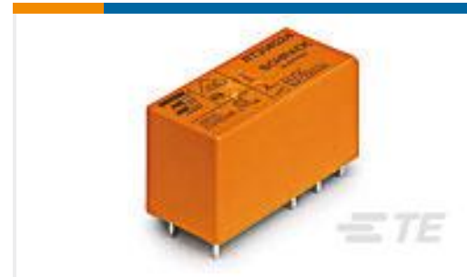
TE Part #8-1393239-8 RT314F24