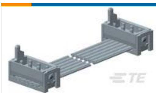
TE Part #1483351-3 MICRO-MATCH LEAD 06P 250MM