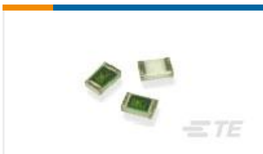
TE Part #1676142-3 RN 0805 100K 0.1% 10PPM 5KRL