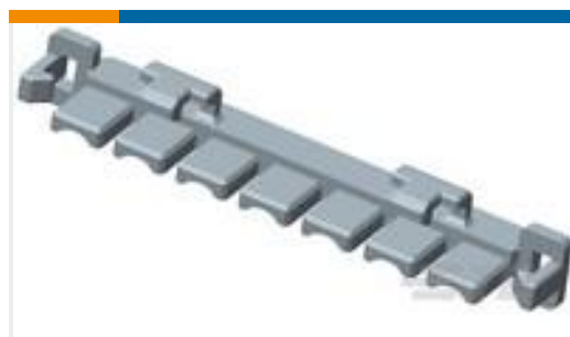
TE Part #1969608-5 5P VAL-U-LOK TPA 22-18 AWG