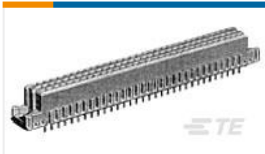
TE Part #535090-4 096 EURO TYPE C RECEPT ST ASSY