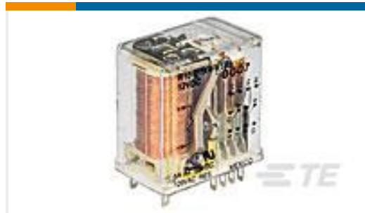
TE Part #1-1393767-5 R10-E2X2-V700=R10