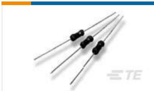
TE Part #7-1625890-0 2W SM M/OX 5% 82K