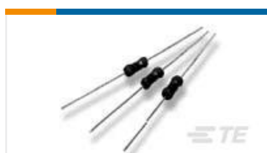
TE Part #7-1625890-0 2W SM M/OX 5% 82K