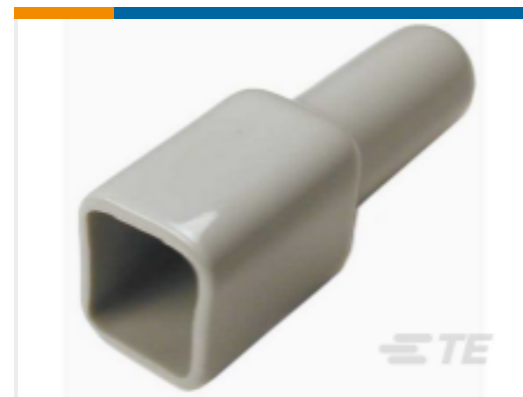
TE Part #DT4P-BT BOOT, 4P, REC, ST, GRY