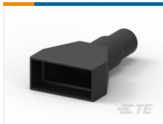
TE Part #DRC40-BT BOOT, 40P, 16SZ, PLG/REC, ST, BLK