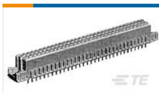
TE Part #535090-4 096 EURO TYPE C RECEPT ST ASSY