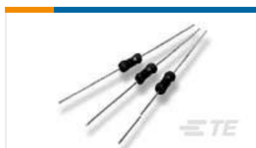
TE Part #7-1625890-0 2W SM M/OX 5% 82K