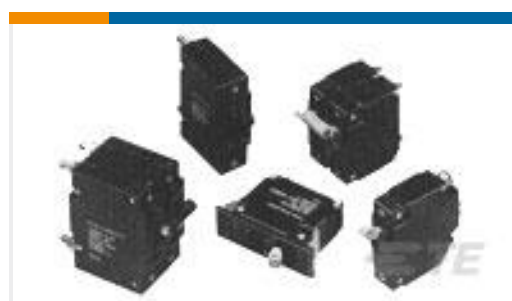
TE Part #6-1393252-1 W67-X2Q12-30=M6/M7/M9/W6/W7