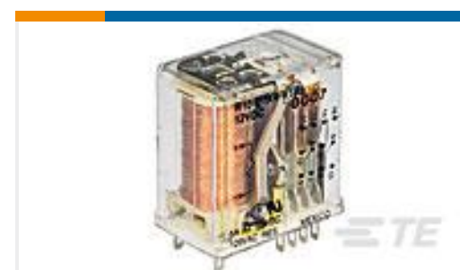
TE Part #1-1393767-5 R10-E2X2-V700=R10