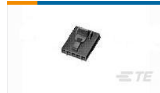
TE Part #104257-2 03 MTE RCPT HSG SR LATCH .100