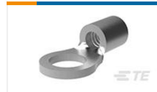
TE Part #2-35476-1 TERMINAL,SOLIS R 12-10 6