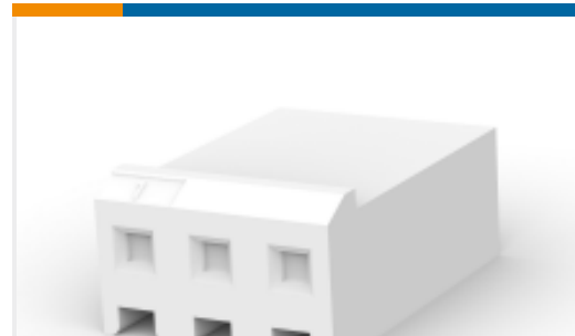
TE Part #640250-6 Receptacle Housing: Wire-to-Board, with Mating Alignment, SL156