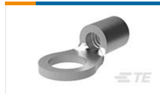
TE Part #33457 TERMINAL,SOLIS R 12-10 10