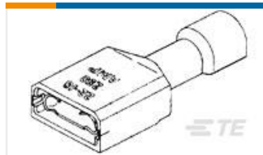
TE Part #2-520183-4 ULTRA-FAST 250 ASY REC 22-18 TPPB