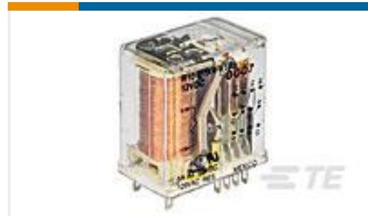
TE Part #1-1393767-5 R10-E2X2-V700=R10