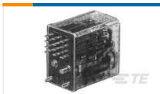
TE Part #1-1393766-9 R10-E1X4-24V=R10