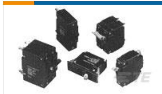
TE Part #6-1393252-1 W67-X2Q12-30=M6/M7/M9/W6/W7