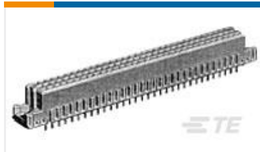
TE Part #535090-4 096 EURO TYPE C RECEPT ST ASSY