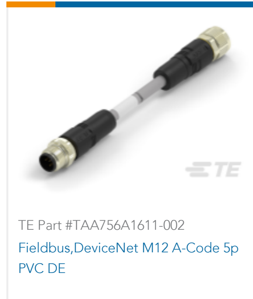
TE Part #TAA756A1611-002 Fieldbus,DeviceNet M12 A-Code 5p PVC DE