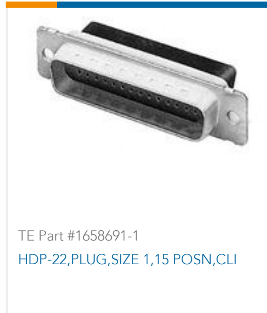
TE Part #1658691-1 HDP-22,PLUG,SIZE 1,15 POSN,CLI