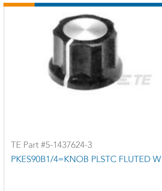
TE Part #5-1437624-3 PKES90B1/4=KNOB PLSTC FLUTED W