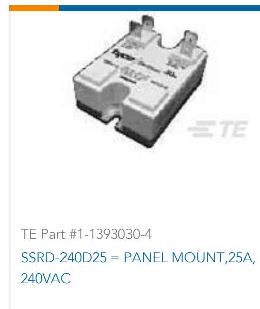
TE Part #1-1393030-4 SSRD-240D25 = PANEL MOUNT,25A, 240VAC