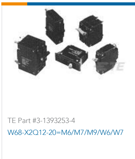
TE Part #3-1393253-4 W68-X2Q12-20=M6/M7/M9/W6/W7