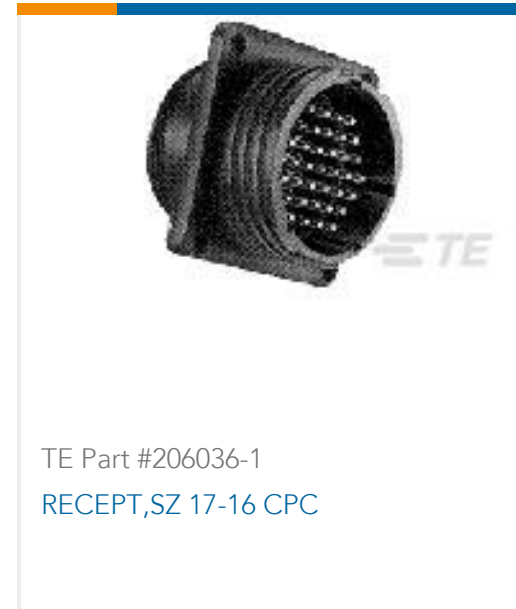
TE Part #206036-1 RECEPT,SZ 17-16 CPC