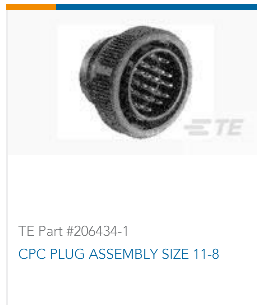
TE Part #206434-1 CPC PLUG ASSEMBLY SIZE 11-8