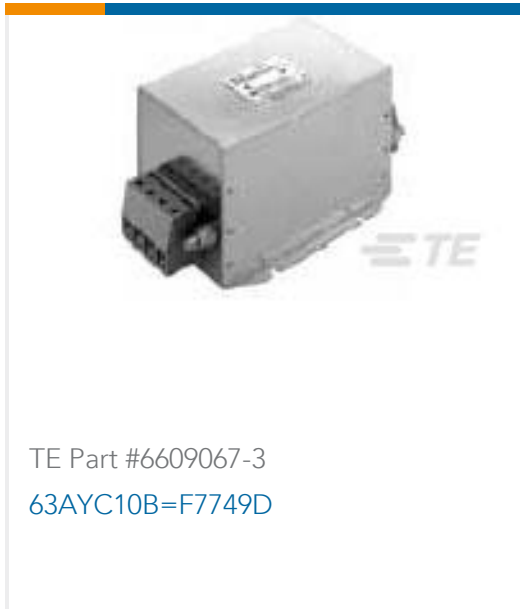
TE Part #6609067-3 63AYC10B=F7749D