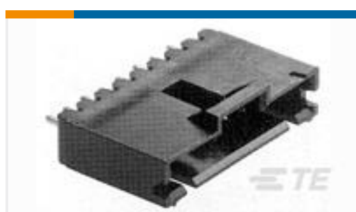
TE Part #6-104363-1 12 MTE HDR SRST LATCH .100CL