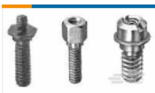
TE Part #749087-1 50SR SCREWLOCK KIT,FEMALE