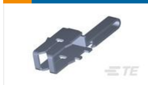
TE Part #1-1394431-1 MAG MATE CONT. 5D