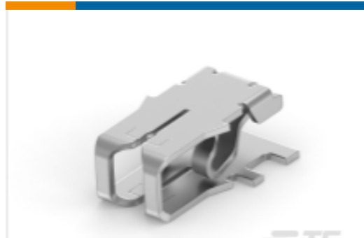
TE Part #964339-5 MAG MATE KONT. MKII