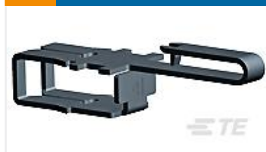
TE Part #1-1394430-1 MAG MATE KONTAKT