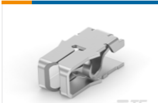
TE Part #964338-5 MAG MATE LEAF KONT