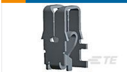
TE Part #964339-2 MAG MATE KONT. MKII