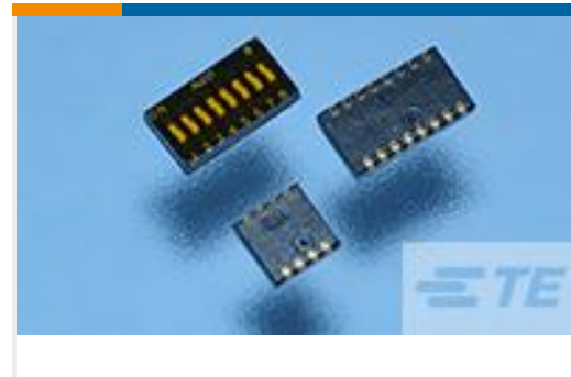
TE Part #1977830-1 DIP SWITCH GDH02SA04