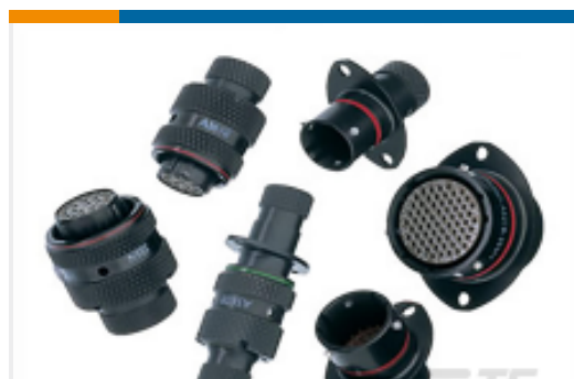
TE Part #AS107-35PA RECEPT. IN LINE TYPE 1 AS MICRO 7