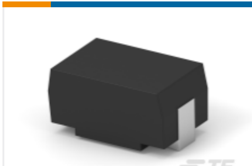
TE Part #7-2176459-7 SMD Power Resistor: 7 Watt, 0.10-500 Ohm