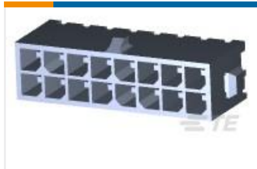
TE Part #4-794632-6 16P MICRO MNL ASSY,VRT,HDR,LF