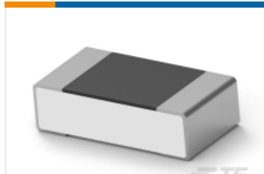
TE Part #3-2176371-5 RQ 0603 10K5 0.1% 10PPM 5K RL