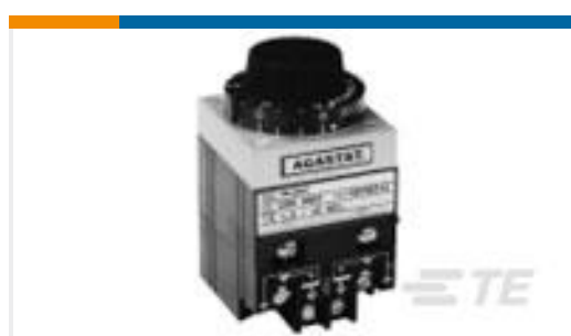
TE Part #1-1423164-9 7022PB=RLY,STD,OFF,2P,125VDC,5