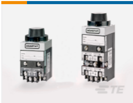
TE Part # 3-1423159-3 7012PJ=RLY,STD,ON,2P,125VDC,1