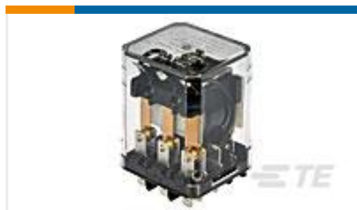
TE Part #4-1393117-3 KUP-11D15-110=KU