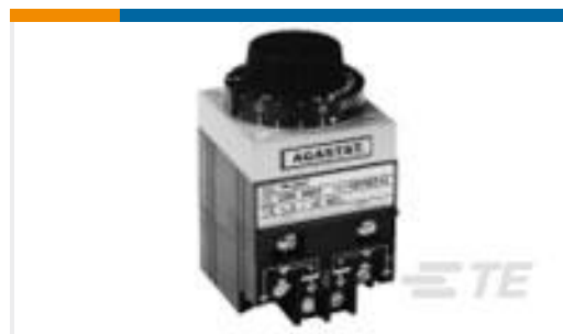
TE Part #1-1423159-9 7012PB=RLY,STD,ON,2P,125VDC, 5