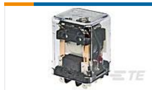
TE Part #8-1393113-8 KUEP-11D15-48=KU