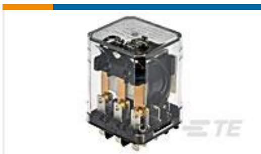
TE Part #1-1393117-9 KUP-11A15-120=KU