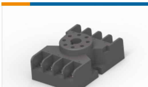
TE Part #1393143-6 27E122=SOCKET,KRP,8,SCW,PLES