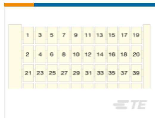
TE Part #1SNA234030R2700 RC810 1->100 HORIZONTAL