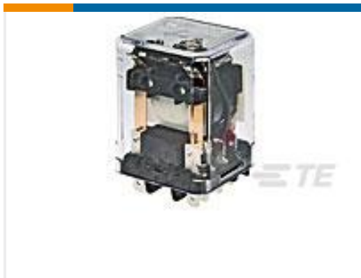
TE Part #8-1393113-7 KUEP-11D15-24=KU-