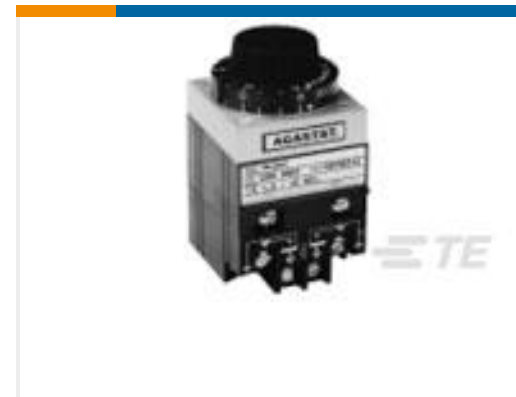
TE Part #1-1423162-2 7022AH=RLY,STD,OFF,2P,120VAC,3