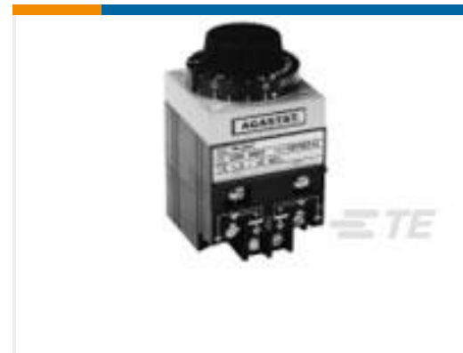
TE Part #1-1423159-7 7012PA=RLY,STD,ON,2P,125VDC,1