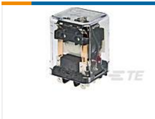
TE Part #4-2027183-3 KUEP-11D15-125=RELAY,3A,2C, AGCDO,QC.187,