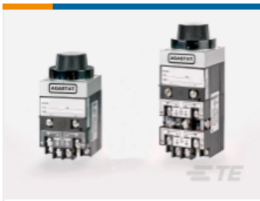
TE Part # 1-1423162-8 7022AK=RLY,STD,OFF,2P,120VAC,1