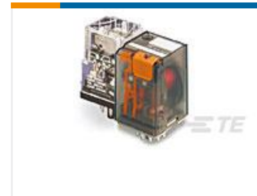
TE Part #4-1393104-4 KRPA-11DG-125=KRPA