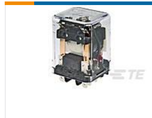
TE Part #8-1393113-3 KUEP-11A15-120=RELAY,GENPUR,QC