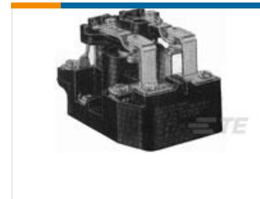
TE Part #1393127-9 PRD-11AG0-120=PRD