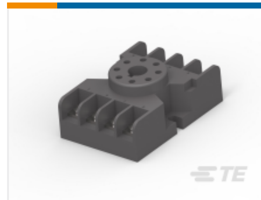
TE Part #1393143-6 27E122=SOCKET,KRP,8,SCW,PLES