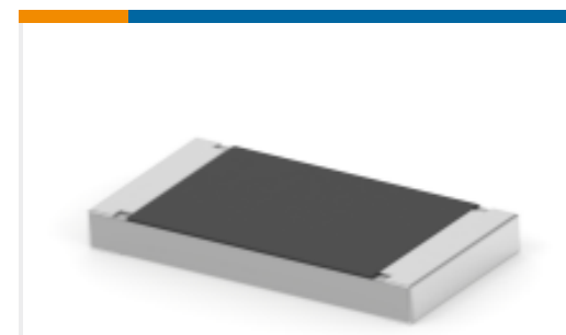
TE Part #2176350-5 CRGCO 2512 4R7 5%