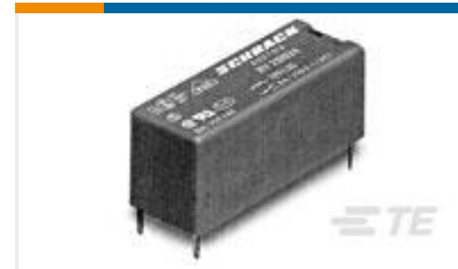
TE Part #4-1393224-9 RY211024