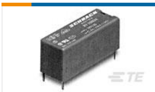
TE Part #4-1393224-6 RY211012