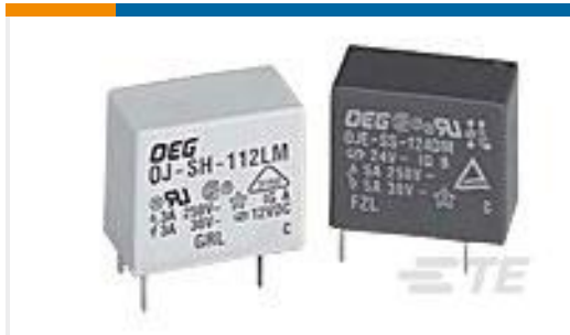
TE Part #6-1419128-2 OJE-SS-124DM,000