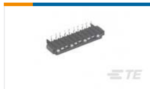
TE Part #6-520314-6 TRIOMATE ASSY H 16P L=2.54LDFR