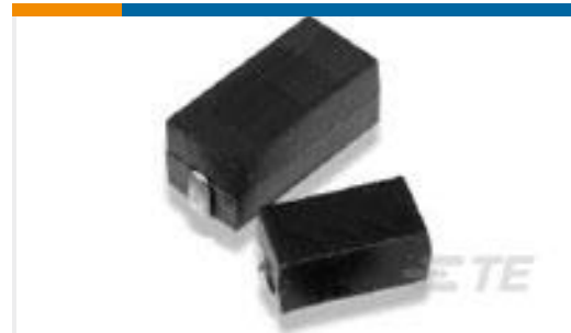
TE Part #4-1879233-9 SMW5 10R 5%