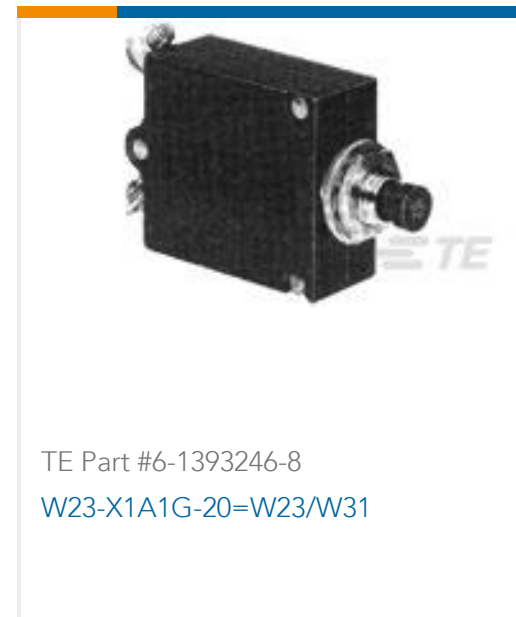
TE Part #6-1393246-8 W23-X1A1G-20=W23/W31