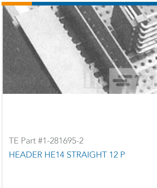
TE Part #1-281695-2 HEADER HE14 STRAIGHT 12 P