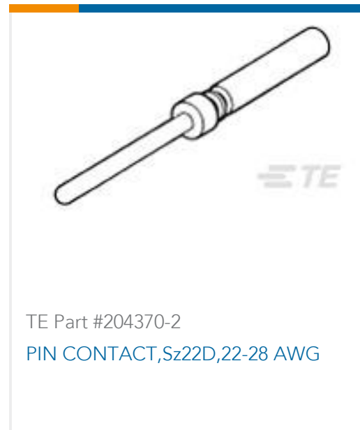
TE Part #204370-2 PIN CONTACT,Sz22D,22-28 AWG