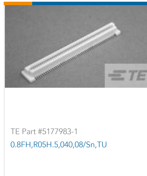
TE Part #5177983-1 0.8FH,R05H.5,040,08/Sn,TU