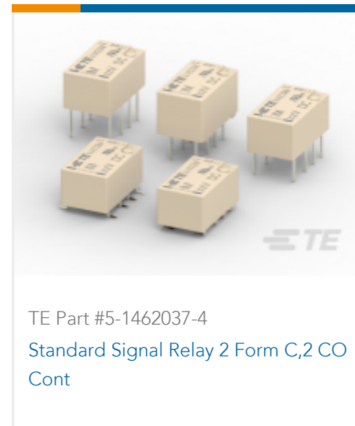
TE Part #5-1462037-4 Standard Signal Relay 2 Form C,2 CO Cont