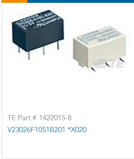
TE Part # 1422015-8 V23026F1051B201 *X020