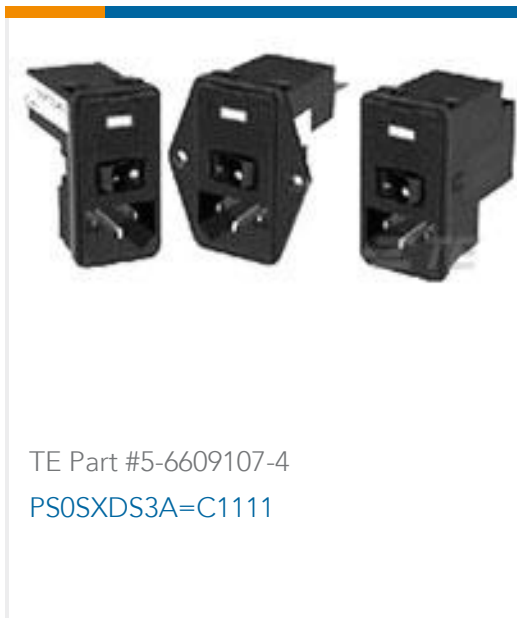
TE Part #5-6609107-4 PS0SXDS3A=C1111