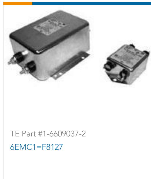
TE Part #1-6609037-2 6EMC1=F8127