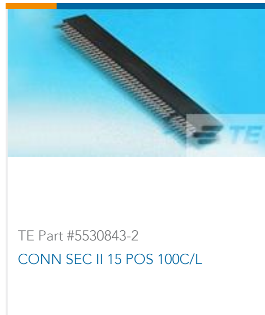
TE Part #5530843-2 CONN SEC II 15 POS 100C/L