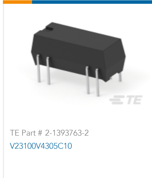
TE Part # 2-1393763-2 V23100V4305C10