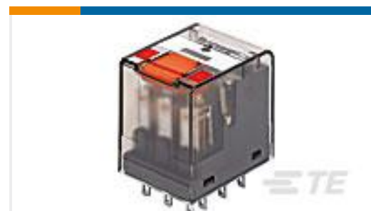
TE Part #8-1419111-0 PT570012