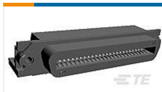
TE Part #5552725-1 ASSY,RCPT,50 POSN, RTANG, PCB