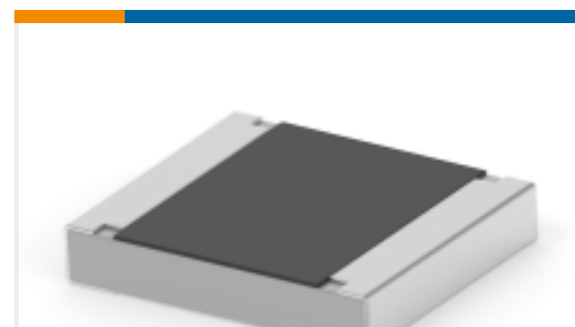
TE Part #2-2176346-3 CRGCO 1210 4K7 5%