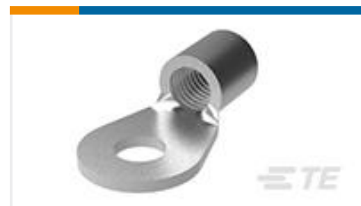
TE Part #36916 TERMINAL,SOLIS R 1/0 5/16