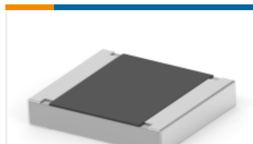
TE Part #3-2176346-8 CRGCO 1210 1M5 5%