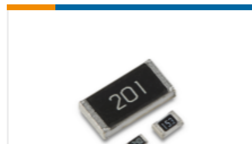
TE Part #3-2176325-7 CRGP 0402 10K 1%