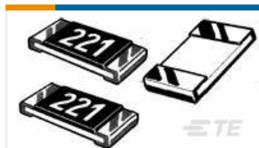
TE Part #2176231-5 3522 15R 1% 3W