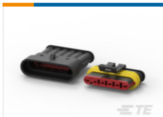
TE Part #282080-1 AMP SUPERSEAL 1.5MM, CONNECTOR HOUSING