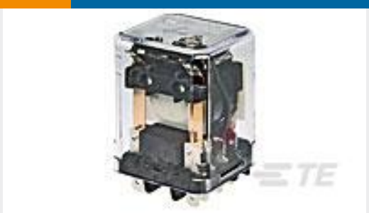
TE Part #8-1393113-8 KUEP-11D15-48=KU