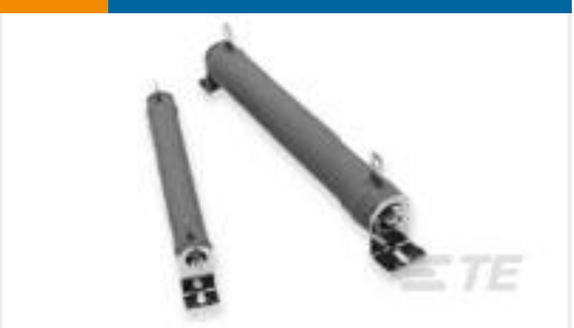
TE Part #2-1879457-1 TE 2500W 47R 5% Bracket