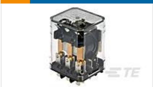
TE Part #1-1393118-0 KUP-14D11-24=KU