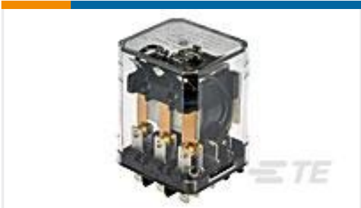
TE Part #2-1393117-1 KUP-11A15-24=KU