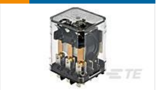
TE Part #4-1393117-7 KUP-11D15-48=KU