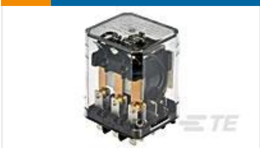
TE Part #5-1393117-9 KUP-11D55-48=KU