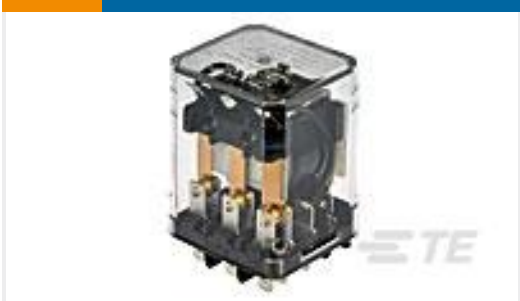
TE Part #4-1393117-4 KUP-11D15-12=KU