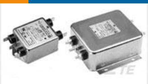
TE Part #6609044-5 20VW6=F7772 S0