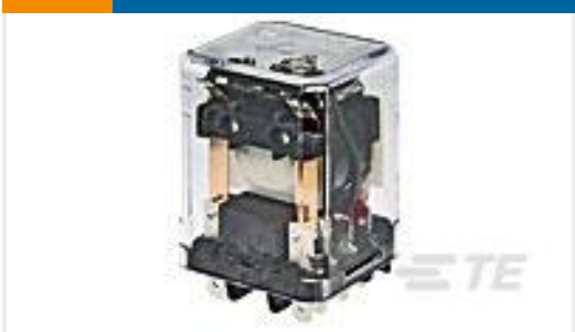
TE Part #4-2027183-3 KUEP-11D15-125=RELAY,3A,2C, AGCDO,QC.187,