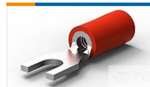
TE Part #165004 PLASTI-GRIP, SPADE 22-16 4