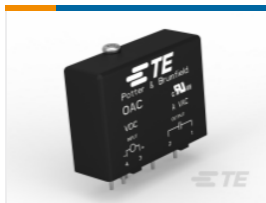
TE Part # CAT-P851-OA1 Solid State Relays: PCB mount