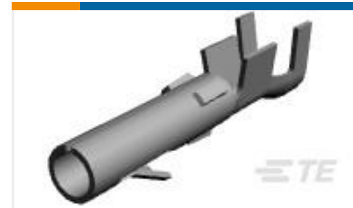
TE Part #61117-4 CMNL SOK 20-14 TPPHBZ