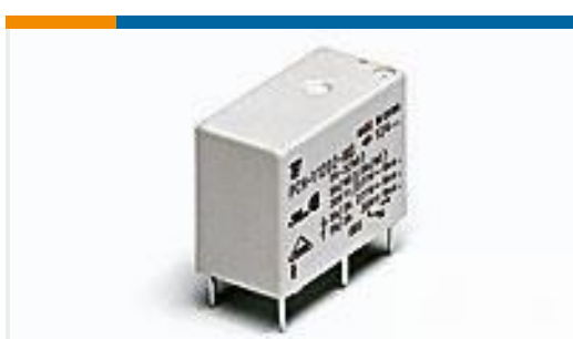
TE Part #1440004 PCH-112D2,000