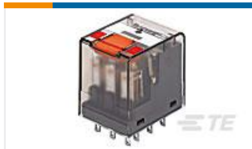
TE Part #9-1415536-4 PT381024