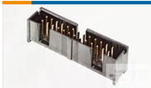
TE Part #1-5103308-3 A/L LOW PRO HDR 24P VERT BLACK