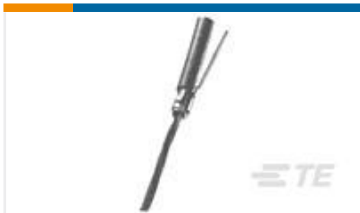
TE Part #2-323930-2 TERMASHIELD, SN, VIOLET, .033-