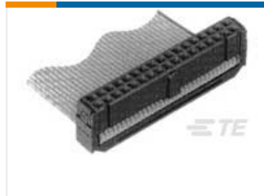
TE Part #1658622-3 16 NOVO MIL/CTR 30DP, LEAD FREE