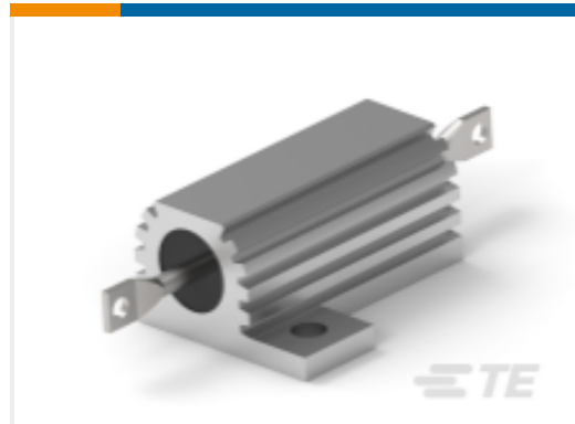
TE Part #2-1879073-5 Power Resistor: Aluminum Housed, 75 Watt