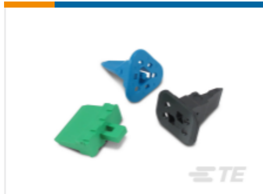
TE Part #W4S-ZZ Wedgelocks: DEUTSCH DT