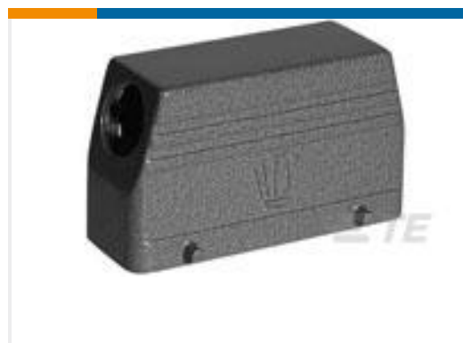
TE Part #1-1102316-6 HB.24.STS.1.21.G