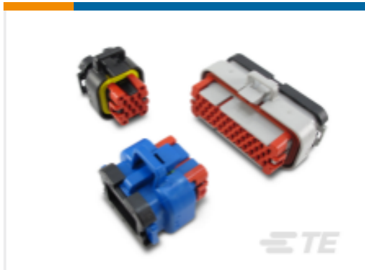
TE Part #776164-1 AMPSEAL Receptacle Housings