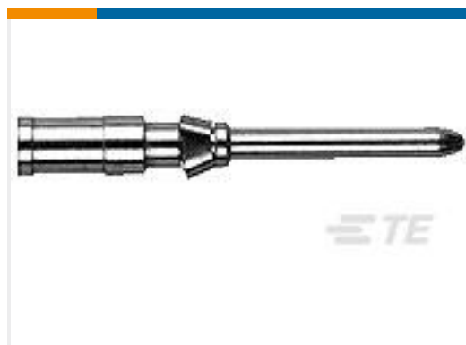
TE Part #2-1105050-1 HN.D-C-STI.AG.0,5