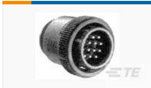
TE Part #206305-1 CPC PLUG ASSEMBLY SIZE 23-37