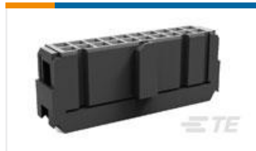
TE Part #1658621-9 40 NOVO MIL/CTR 15DP,LEAD FREE