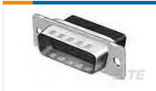
TE Part #1658641-3 PLUG ASSY SIZE 5