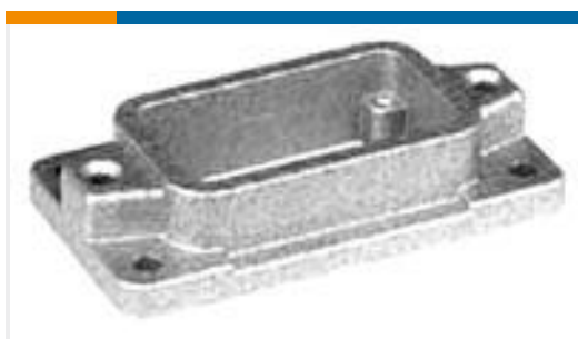
TE Part #2-1102606-5 HIP-K.6/16.AG.M6