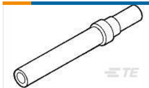
TE Part #205090-1 HD 20 SOCKET CONTACT