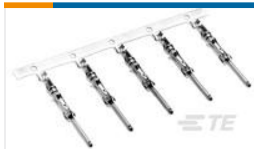
TE Part #1-66098-8 III+ PIN,18-16,TIN STRIP