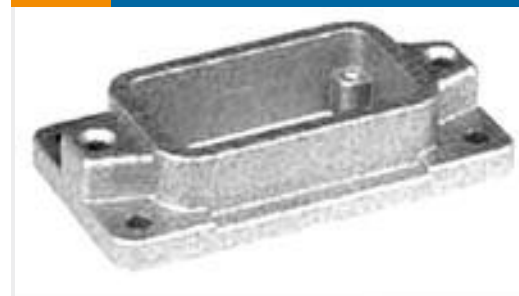
TE Part #2-1102618-5 HIP-K.16/40.AG.M6