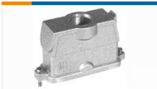
TE Part #1106436-7 HIPK10.STS+STO1M25G