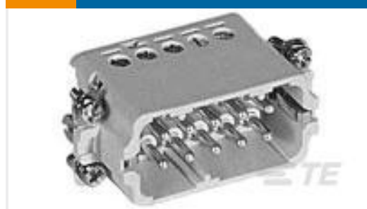
TE Part #1-1103634-1 HE.6.STI.S