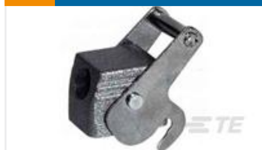
TE Part #2-1102240-3 HBK/Z.6.STSZB.1.16G