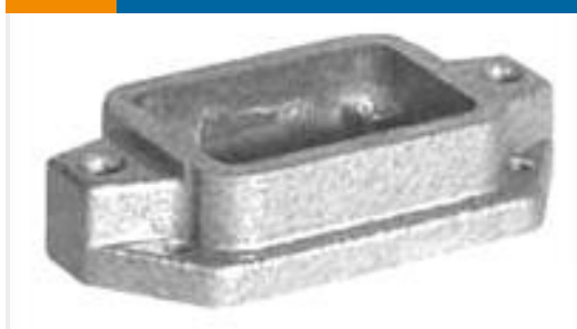
TE Part #2-1102647-5 HIP-K.10/24.AG