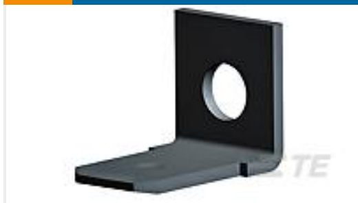
TE Part #181953-1 250 FASTON,TAB,BR