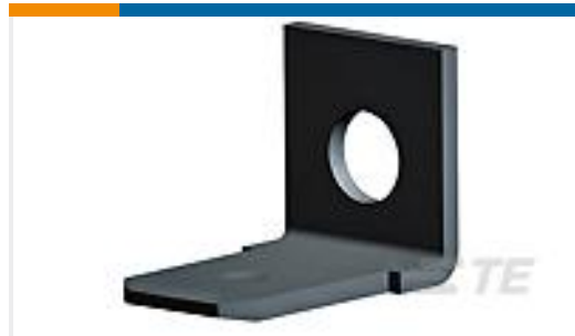
TE Part #181953-1 250 FASTON,TAB,BR