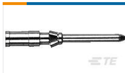
TE Part #3-1105050-1 HN.D-C-STI.AG.0,75