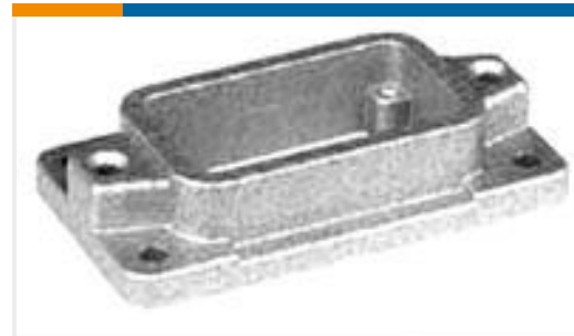
TE Part #2-1102618-5 HIP-K.16/40.AG.M6