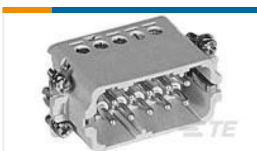
TE Part #1-1103634-1 HE.6.STI.S