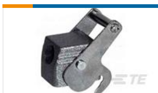
TE Part #2-1102240-3 HBK/Z.6.STSZB.1.16G