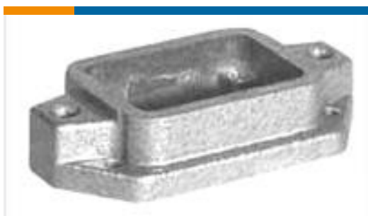
TE Part #2-1102647-5 HIP-K.10/24.AG