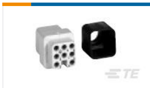
TE Part #2-1103101-3 HN.D.7.BU.C. 250 V