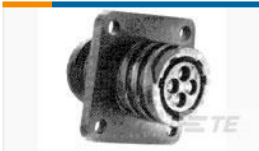
TE Part #182641-1 17-14 CPC SQ FLANGE RECPT RS