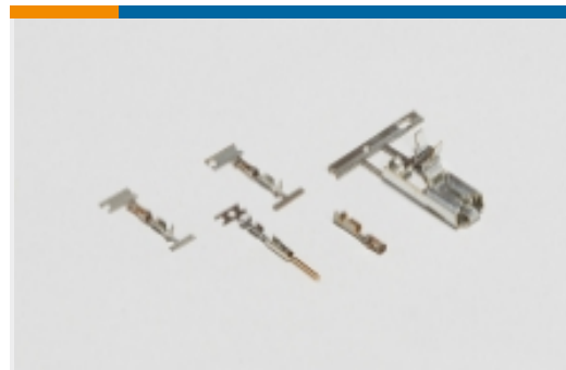
Wire-to-Board Connector Contacts(32)