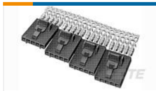
TE Part #5-103957-2 8X3 MTE RCPT SR LATCH .100CL