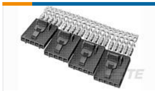
TE Part # 5-103959-7 2X8 MTE RCPT SR LATCH .100CL