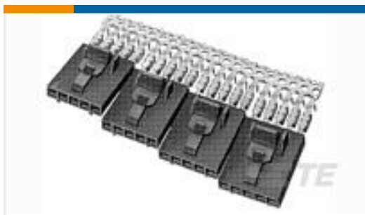
TE Part # 5-103956-7 2X8 MTE RCPT SR LATCH .100CL