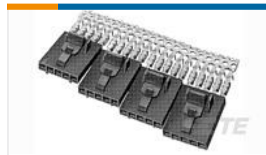
TE Part #5-103957-5 4X6 MTE RCPT SR LATCH .100CL