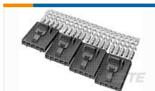
TE Part #5-103957-7 2X8 MTE RCPT SR LATCH .100CL