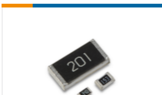
TE Part #2-2176329-5 CRGP 1210 1K0 1%