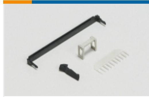
Ribbon Connector Accessories(1)