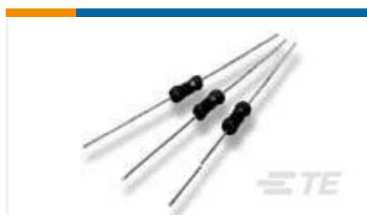
TE Part #7-1879354-0 RR03 5% 240R AMMO