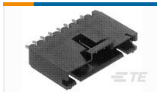
TE Part #103639-2 03 MTE HDR SRST LATCH .100CL