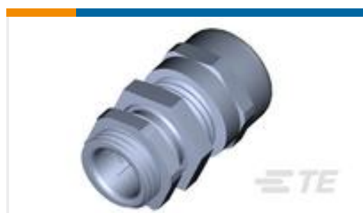
TE Part #1478884-2 Metric EMC Gland M16x1.5