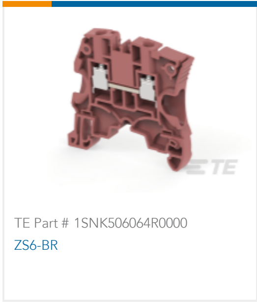
TE Part # 1SNK506064R0000 ZS6-BR