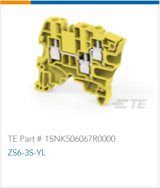
TE Part # 1SNK506067R0000 ZS6-3S-YL