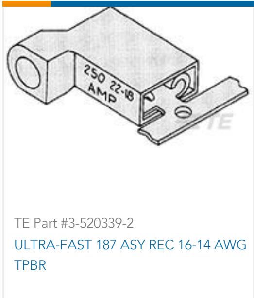
TE Part #3-520339-2 ULTRA-FAST 187 ASY REC 16-14 AWG TPBR