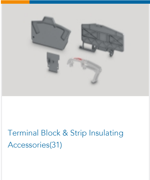
Terminal Block & Strip Insulating Accessories(31)