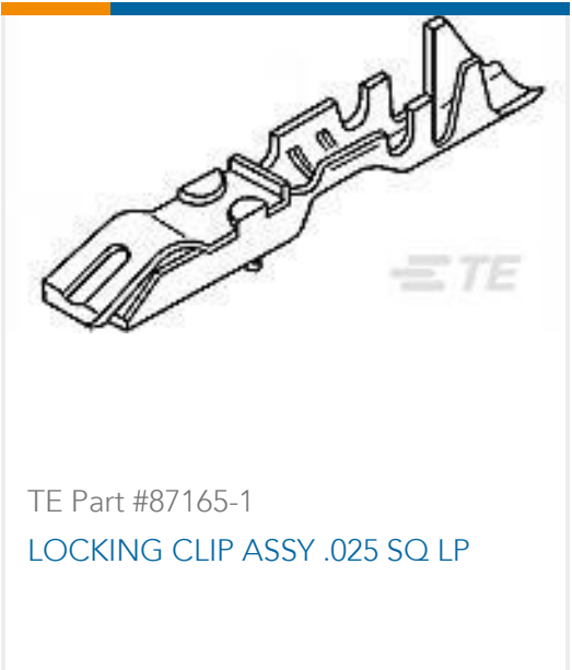
TE Part #87165-1 LOCKING CLIP ASSY .025 SQ LP