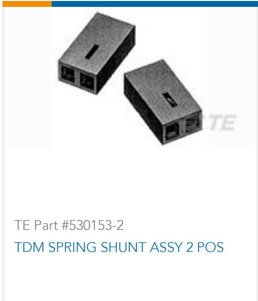
TE Part #530153-2 TDM SPRING SHUNT ASSY 2 POS