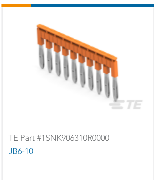
TE Part #1SNK906310R0000 JB6-10