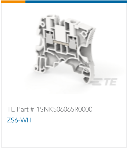
TE Part # 1SNK506065R0000 ZS6-WH