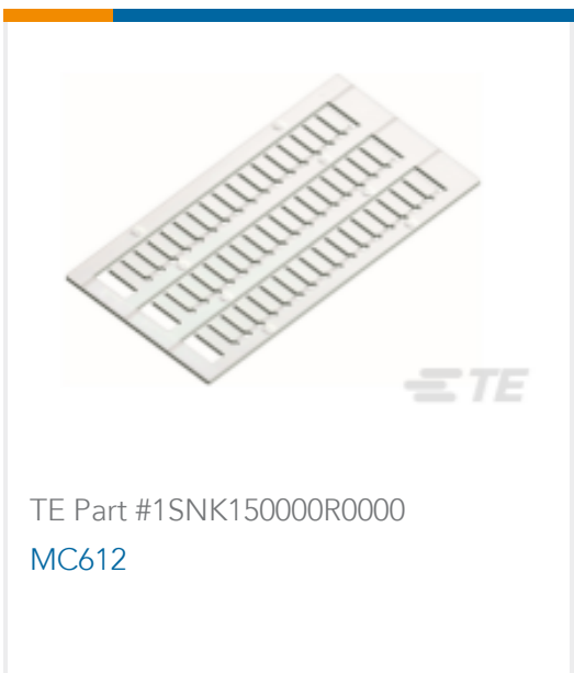
TE Part #1SNK150000R0000 MC612