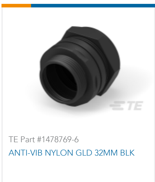
TE Part #1478769-6 ANTI-VIB NYLON GLD 32MM BLK