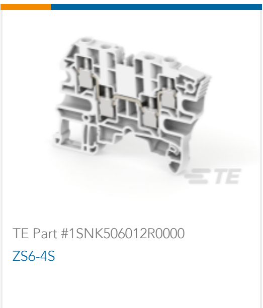
TE Part #1SNK506012R0000 ZS6-4S