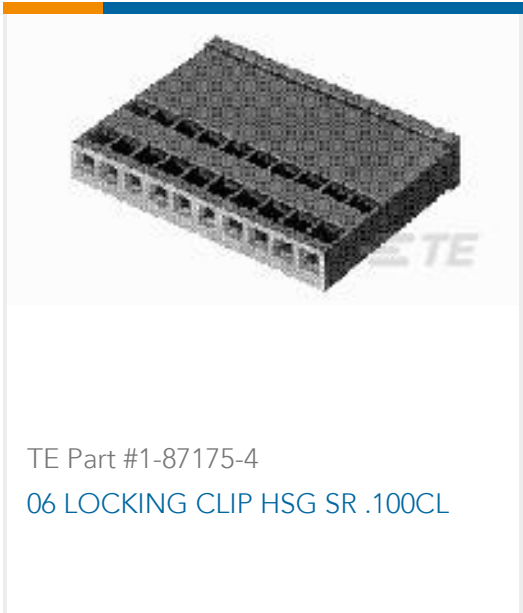
TE Part #1-87175-4 06 LOCKING CLIP HSG SR .100CL