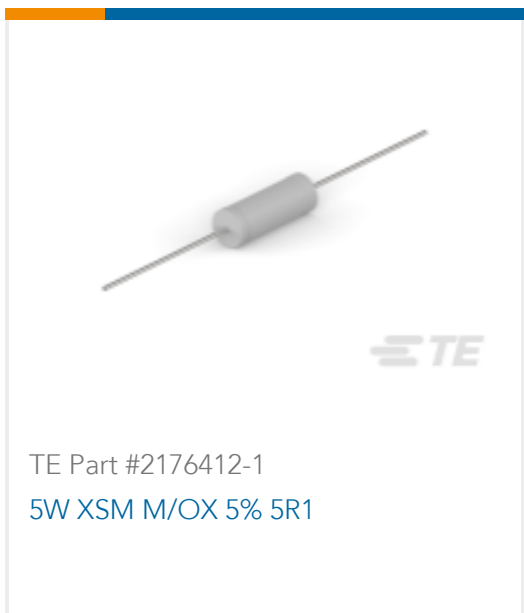
TE Part #2176412-1 5W XSM M/OX 5% 5R1