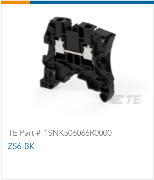
TE Part # 1SNK506066R0000 ZS6-BK