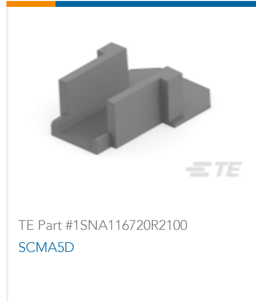
TE Part #1SNA116720R2100 SCMA5D