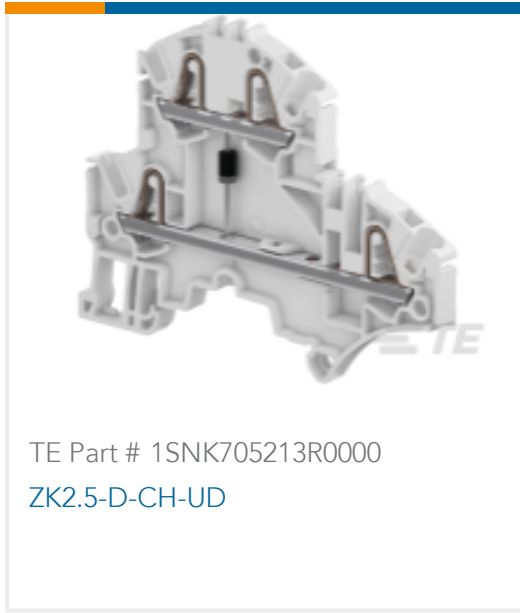
TE Part # 1SNK705213R0000 ZK2.5-D-CH-UD