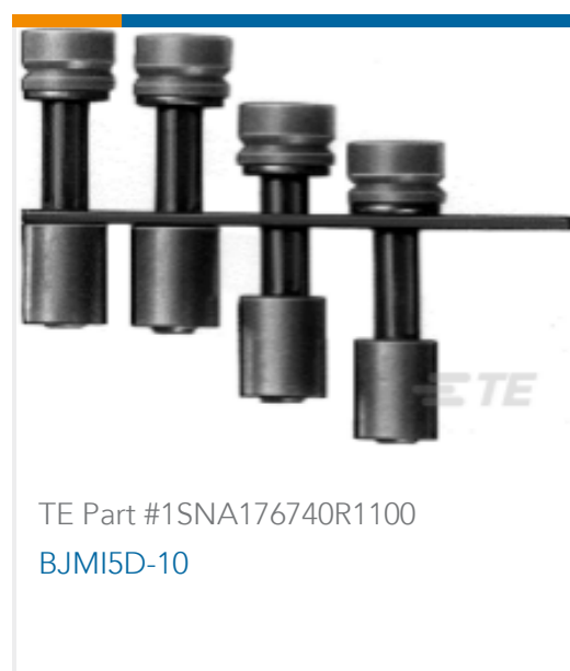
TE Part #1SNA176740R1100 BJM5D-10