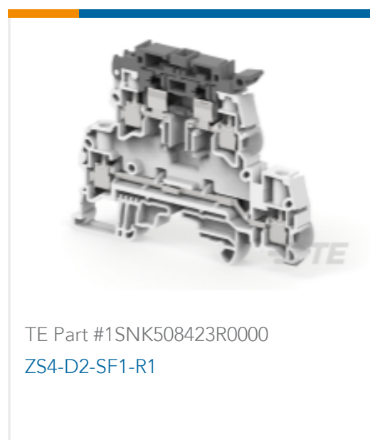
TE Part #1SNK508423R0000 ZS4-D2-SF1-R1