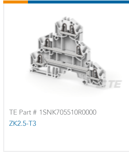
TE Part # 1SNK705510R0000 ZK2.5-T3