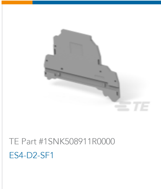
TE Part #1SNK508911R0000 ES4-D2-SF1