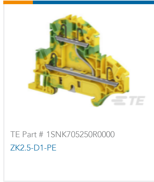
TE Part # 1SNK705250R0000 ZK2.5-D1-PE