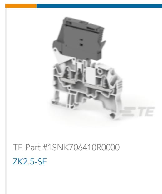
TE Part #1SNK706410R0000 ZK2.5-SF