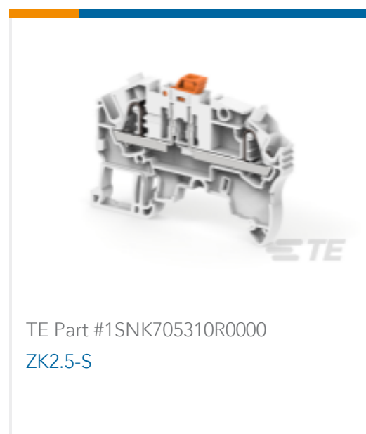
TE Part #1SNK705310R0000 ZK2.5-S