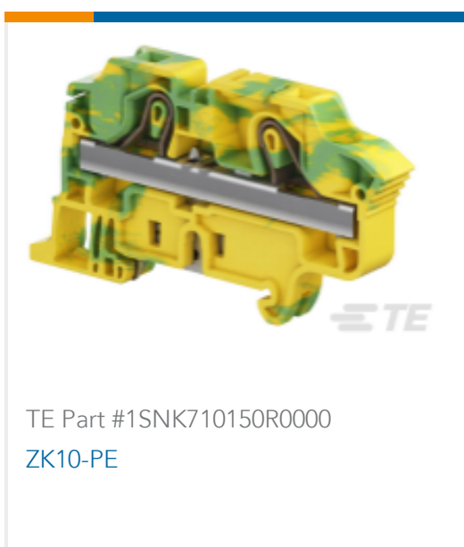
TE Part #1SNK710150R0000 ZK10-PE