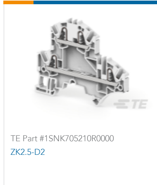
TE Part #1SNK705210R0000 ZK2.5-D2