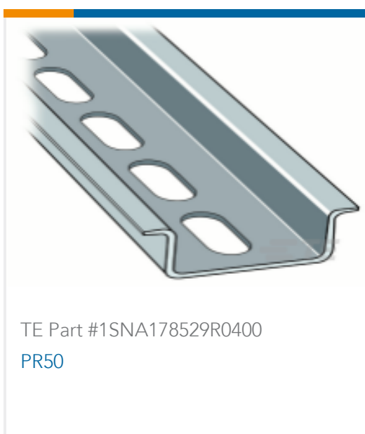
TE Part #1SNA178529R0400 PR50