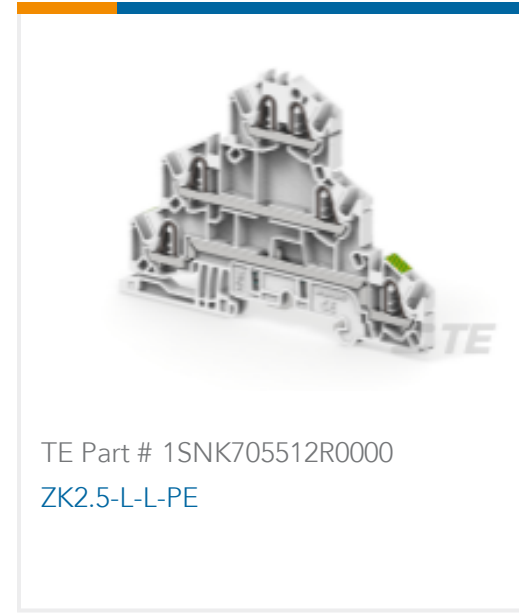
TE Part # 1SNK705512R0000 ZK2.5-L-L-PE