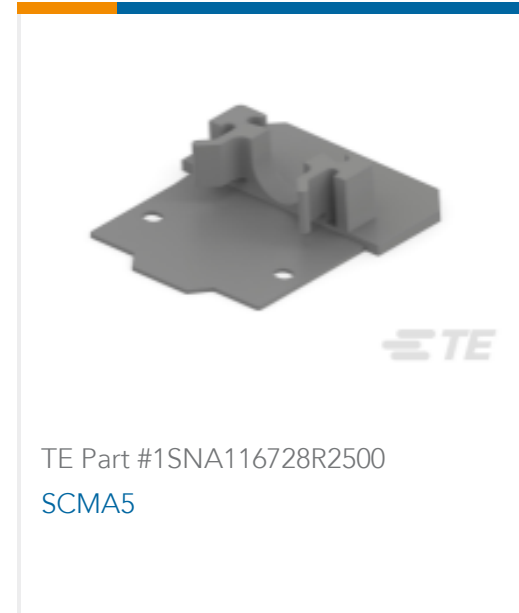
TE Part #1SNA116728R2500 SCMA5