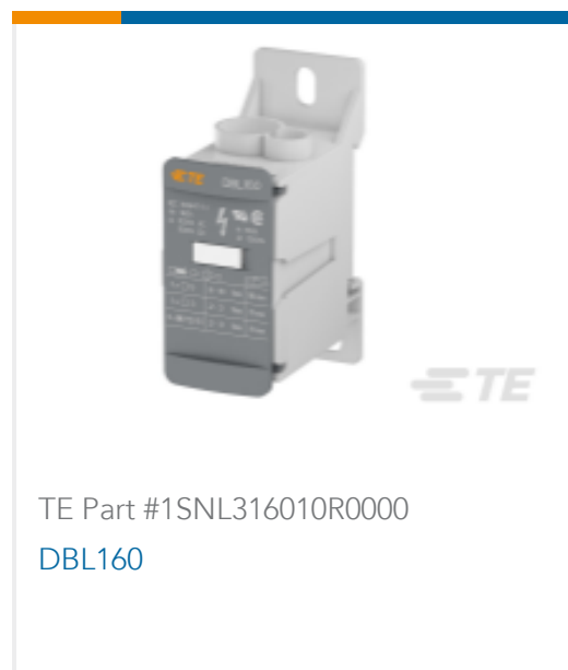
TE Part #1SNL316010R0000 DBL160