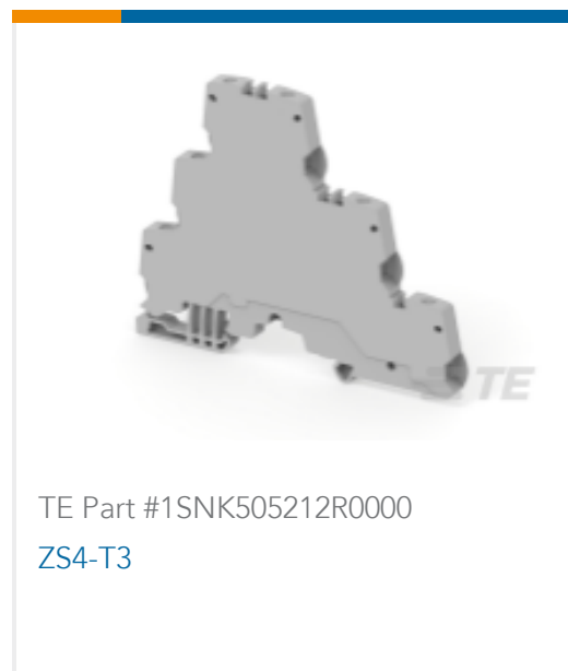
TE Part #1SNK505212R0000 ZS4-T3