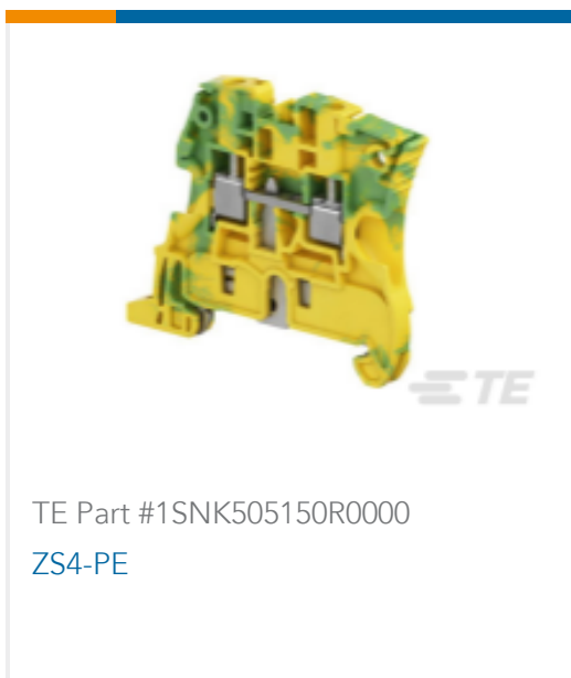
TE Part #1SNK505150R0000 ZS4-PE