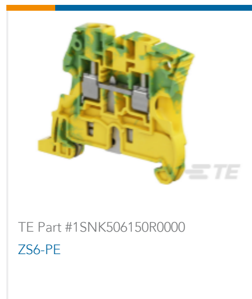
TE Part #1SNK506150R0000 ZS6-PE