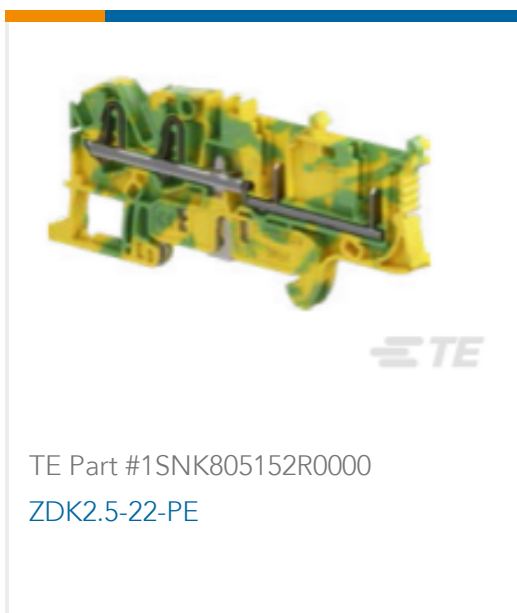
TE Part #1SNK805152R0000 ZDK2.5-22-PE