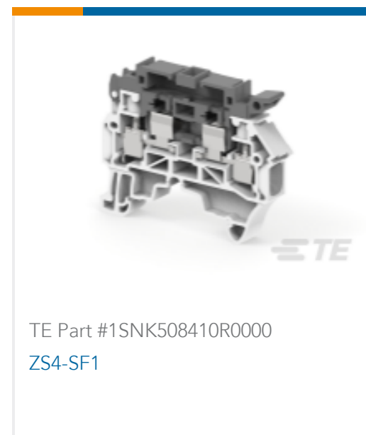
TE Part #1SNK508410R0000 ZS4-SF1