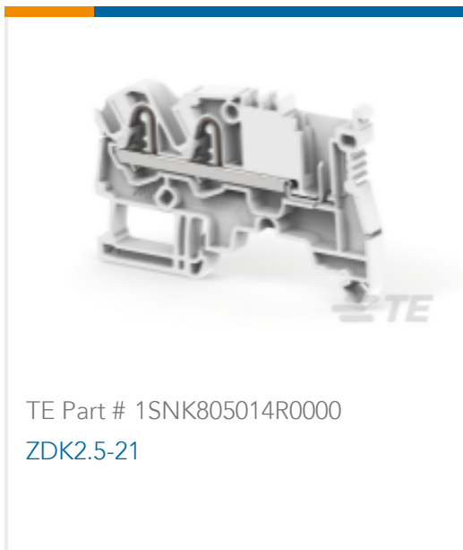
TE Part # 1SNK805014R0000 ZDK2.5-21