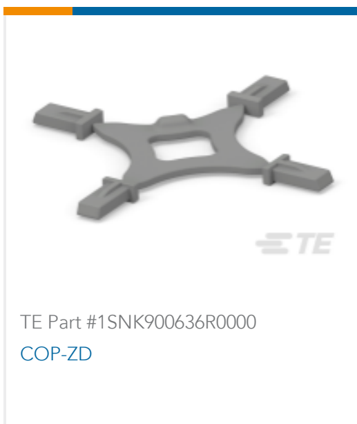
TE Part #1SNK900636R0000 COP-ZD