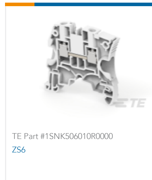
TE Part #1SNK506010R0000 ZS6