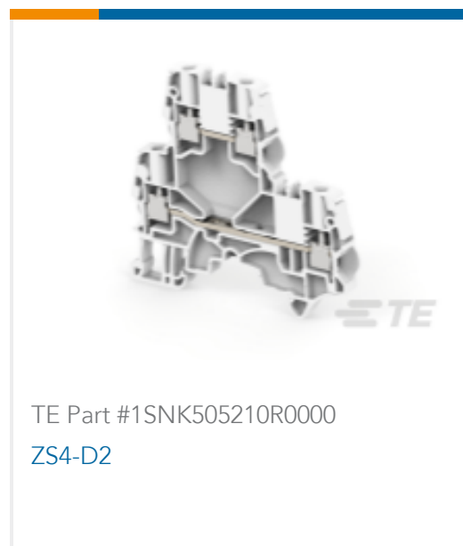
TE Part #1SNK505210R0000 ZS4-D2