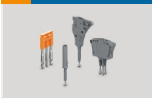
Terminal Block & Strip Conducting Accessories(67)