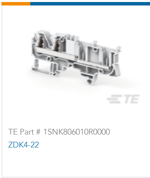
TE Part # 1SNK806010R0000 ZDK4-22