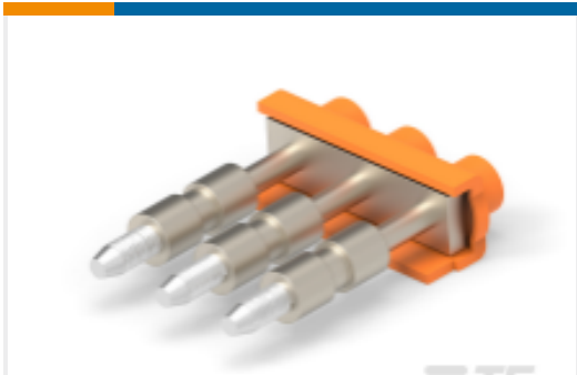
TE Part #1SNK908903R0000 JB8-3-R1