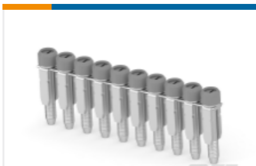
TE Part #1SNL906610R0000 BJC16-10