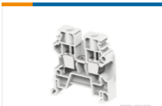
TE Part #1SNL508010R0000 C6/8