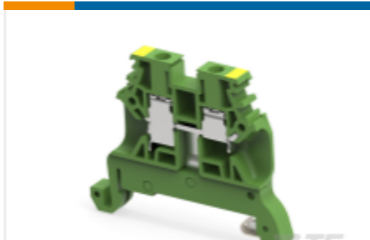
TE Part #1SNL506010R0000 C4/6