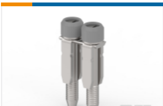
TE Part #1SNL906602R0000 BJC16-2