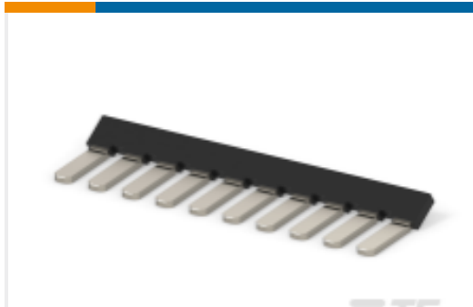
TE Part #1SNA163313R2400 PC8-10