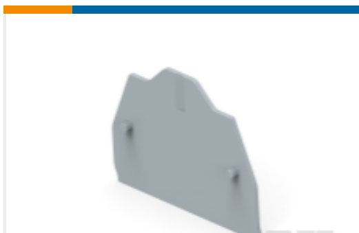
TE Part #1SNL900100R0000 EP5-6