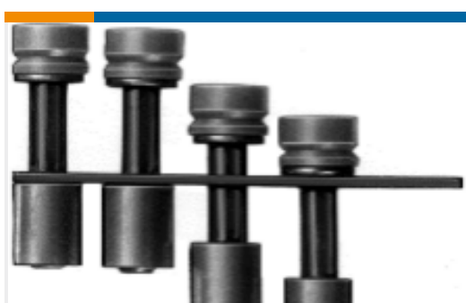
TE Part #1SNA179670R2600 BJM16D-4