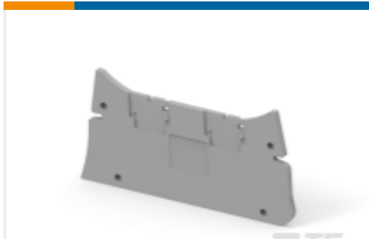
TE Part #1SNK508910R0000 ES10-ST