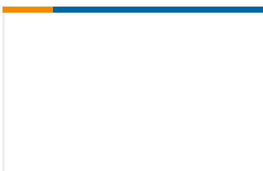
TE Part #1SNA115970R2300 TERMINAL BLOCK M6/8.ST8