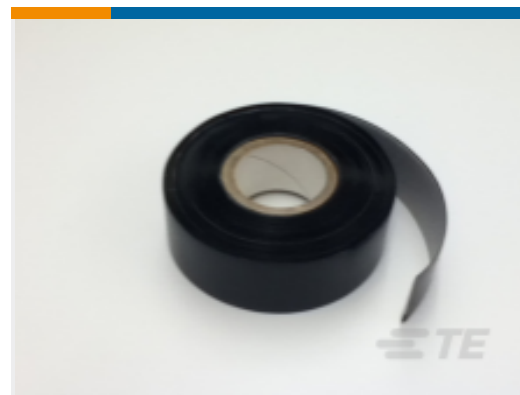
TE Part #890901-006 S1030