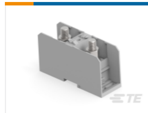
TE Part #1SNA190005R2400 D300/55.FF