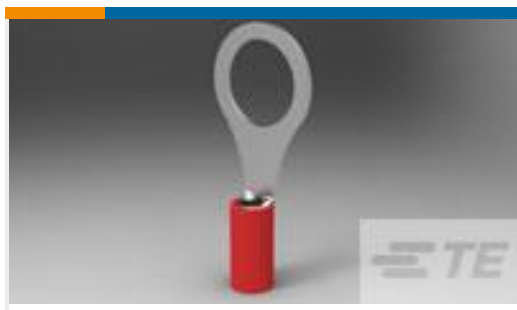
TE Part #328975 PIDG R 22-16COMM 22-18MIL 1/2