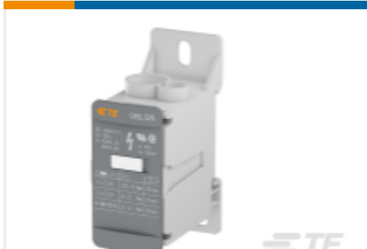
TE Part #1SNL312510R0000 DBL125