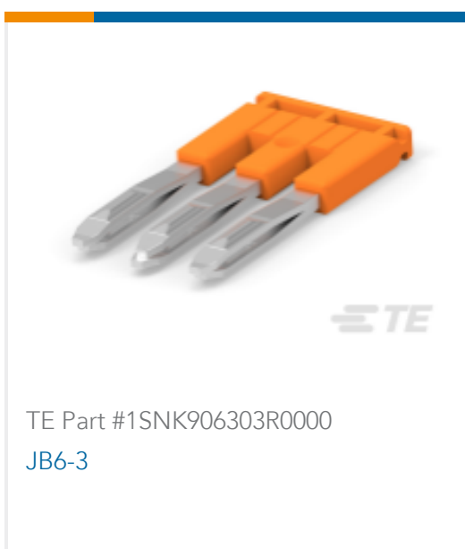
TE Part #1SNK906303R0000 JB6-3