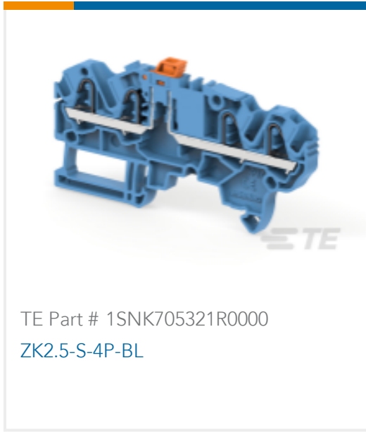
TE Part # 1SNK705321R0000 ZK2.5-S-4P-BL