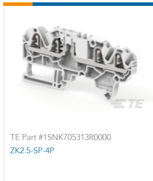
TE Part #1SNK705313R0000 ZK2.5-SP-4P