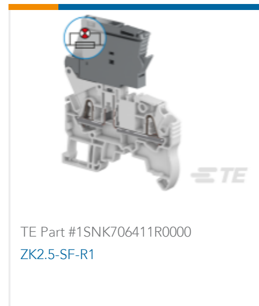
TE Part #1SNK706411R0000 ZK2.5-SF-R1