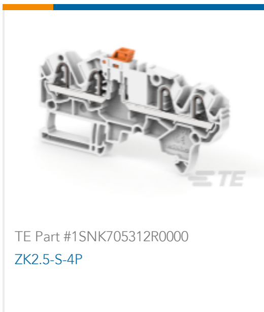
TE Part #1SNK705312R0000 ZK2.5-S-4P