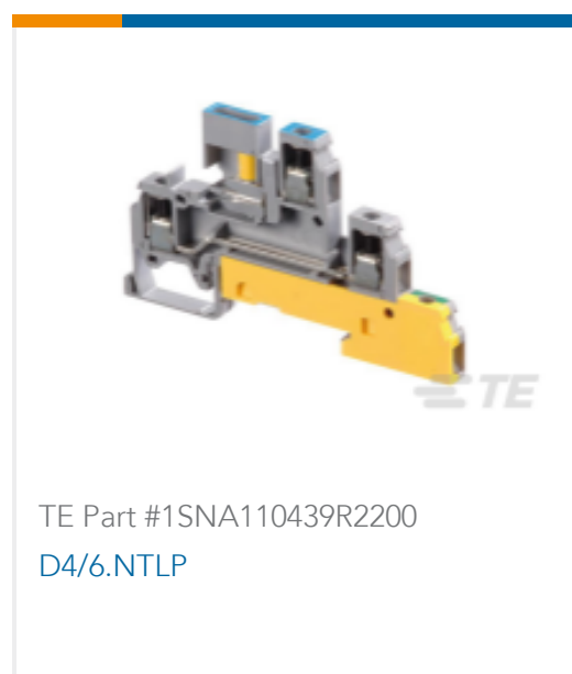
TE Part #1SNA110439R2200 D4/6.NTLP