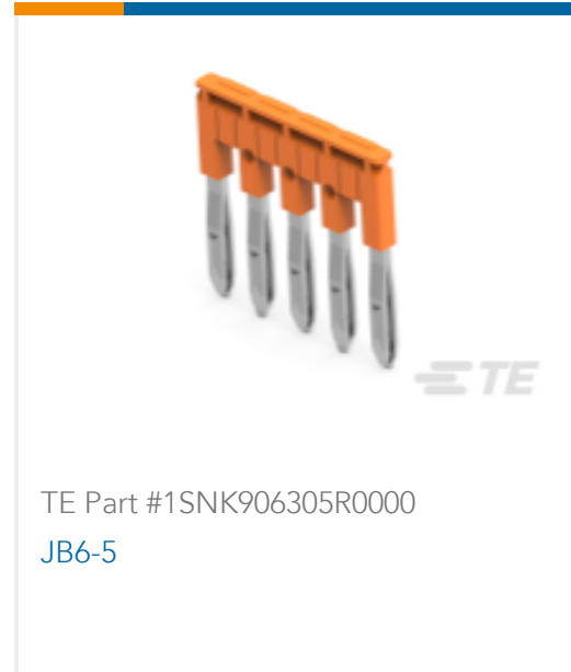
TE Part #1SNK906305R0000 JB6-5