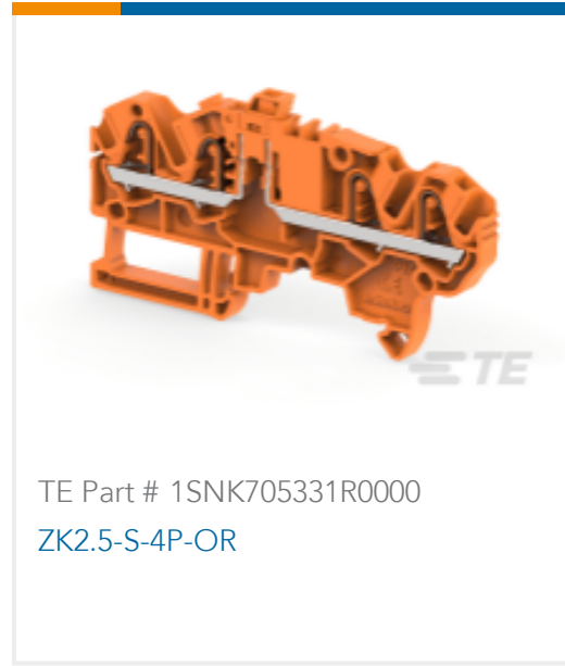
TE Part # 1SNK705331R0000 ZK2.5-S-4P-OR