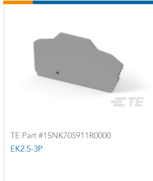
TE Part #1SNK705911R0000 EK2.5-3P