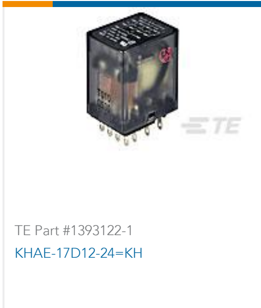
TE Part #1393122-1 KHAE-17D12-24=KH