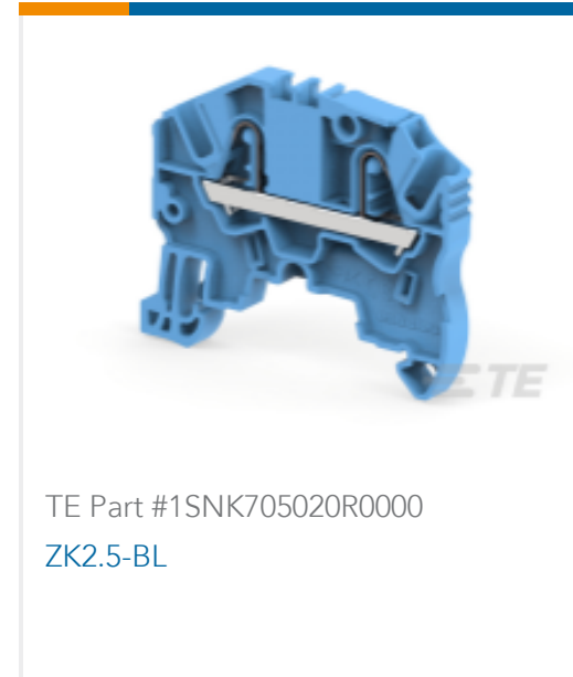
TE Part #1SNK705020R0000 ZK2.5-BL