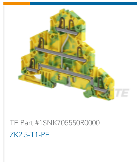
TE Part #1SNK705550R0000 ZK2.5-T1-PE