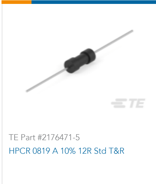
TE Part #2176471-5 HPCR 0819 A 10% 12R Std T&R