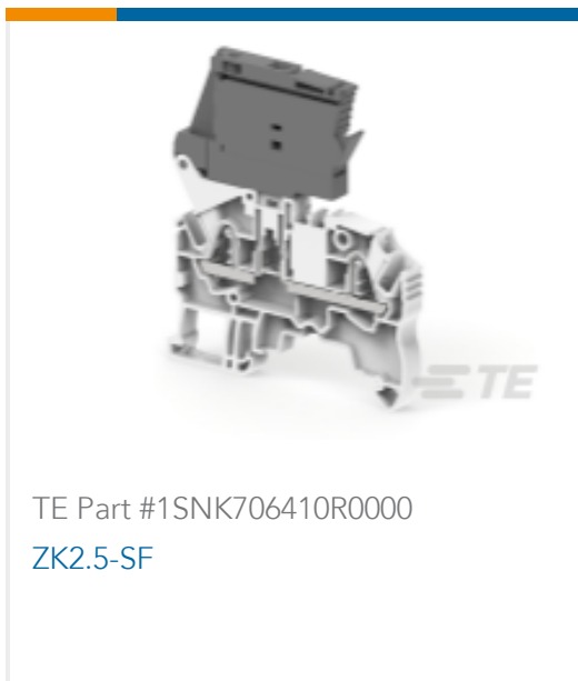
TE Part #1SNK706410R0000 ZK2.5-SF