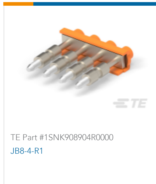
TE Part #1SNK908904R0000 JB8-4-R1