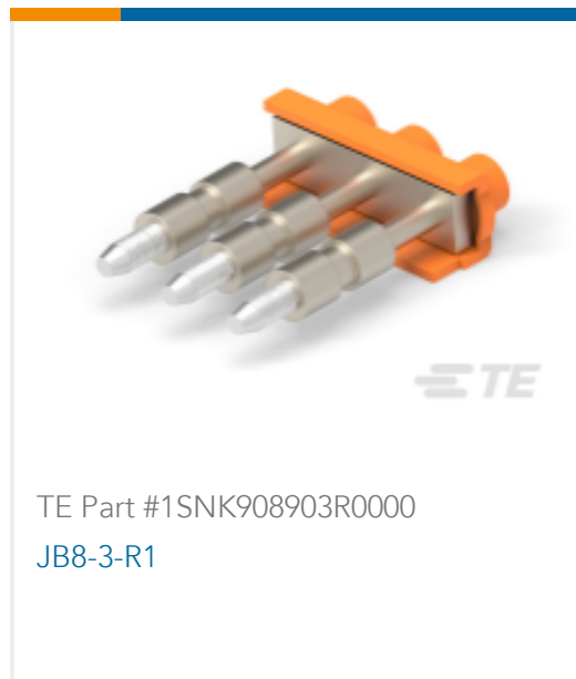
TE Part #1SNK908903R0000 JB8-3-R1