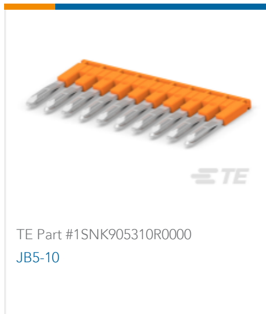
TE Part #1SNK905310R0000 JB5-10