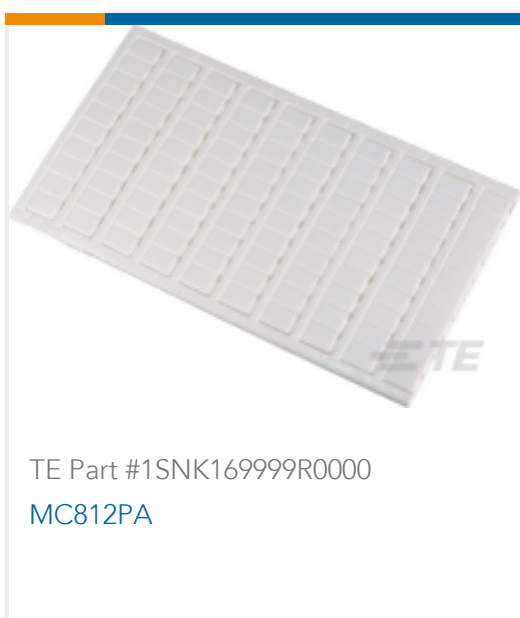
TE Part #1SNK169999R0000 MC812PA