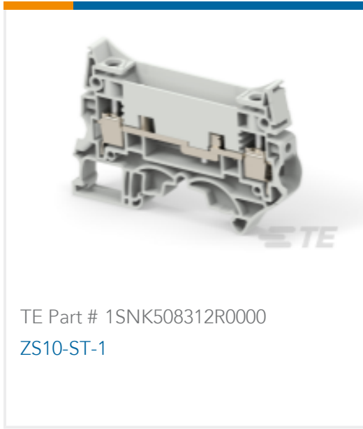
TE Part # 1SNK508312R0000 ZS10-ST-1