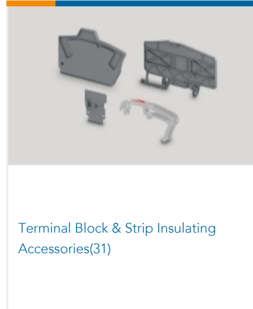
Terminal Block & Strip Insulating Accessories(31)