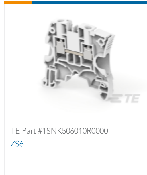
TE Part #1SNK506010R0000 ZS6