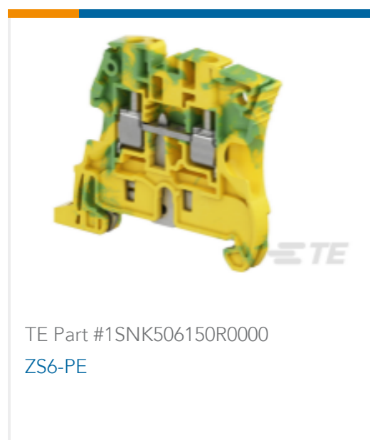
TE Part #1SNK506150R0000 ZS6-PE