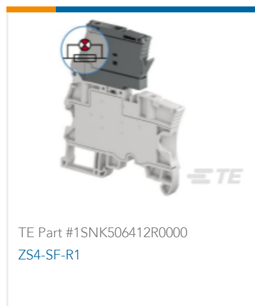
TE Part #1SNK506412R0000 ZS4-SF-R1