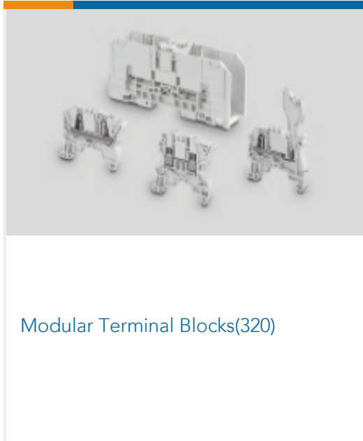
Modular Terminal Blocks(320)