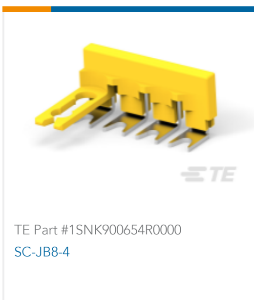
TE Part #1SNK900654R0000 SC-JB8-4