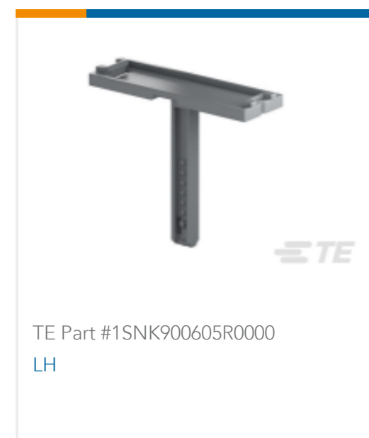
TE Part #1SNK900605R0000 LH