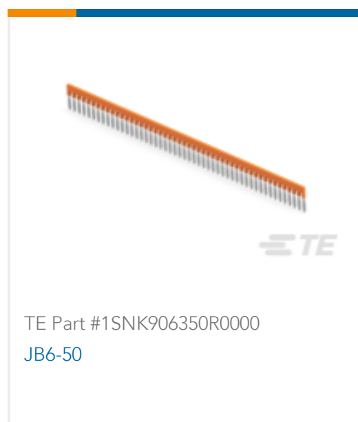
TE Part #1SNK906350R0000 JB6-50