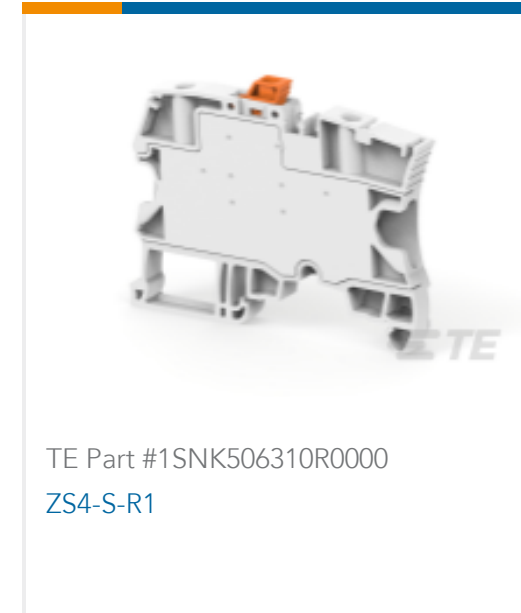
TE Part #1SNK506310R0000 ZS4-S-R1