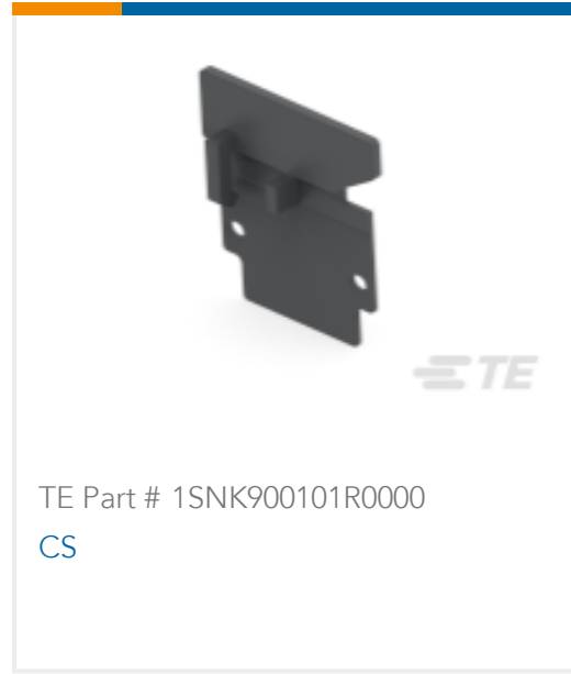
TE Part # 1SNK900101R0000 CS