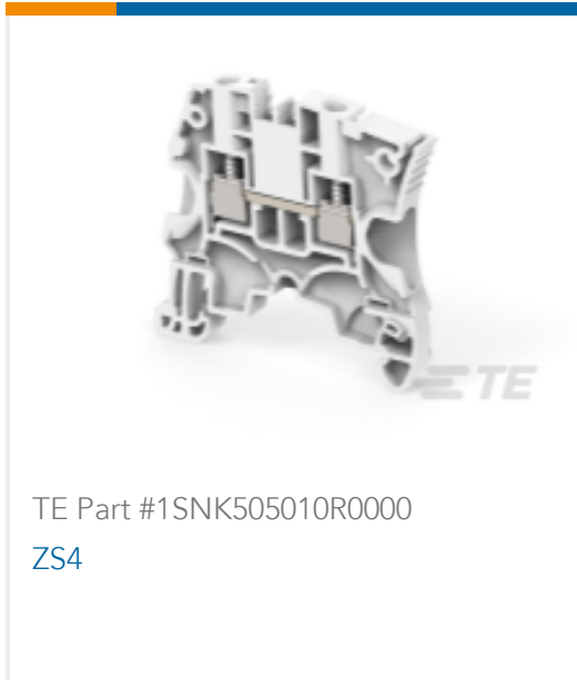
TE Part #1SNK505010R0000 ZS4