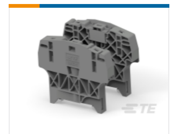
TE Part # 1SNK900624R0000 KCO