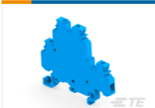
TE Part #1SNA125490R1500 MA2.5/5.D2.N