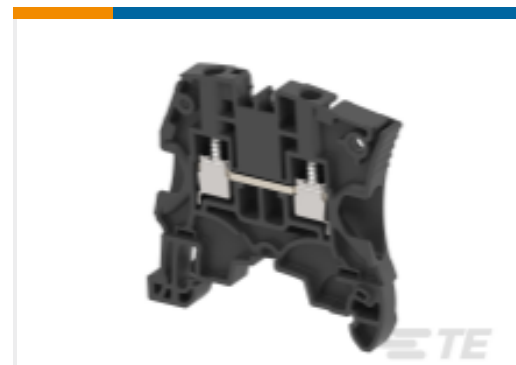
TE Part #1SNK505066R0000 ZS4-BK