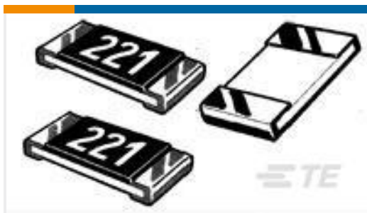
TE Part #4-1622820-0 3520 33R 5%