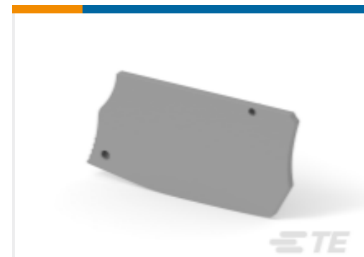
TE Part #1SNK505910R0000 ES4