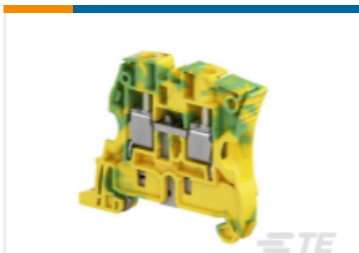
TE Part #1SNK508150R0000 ZS10-PE