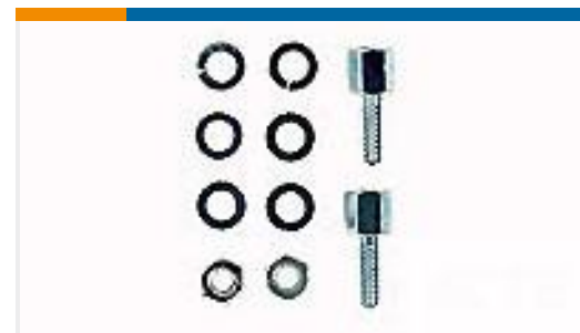
TE Part #5205817-4 FEMALE SCREWLOCK KIT