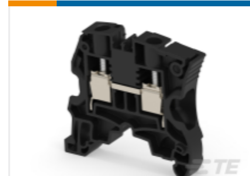
TE Part #1SNK508066R0000 ZS10-BK