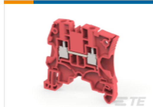
TE Part #1SNK505062R0000 ZS4-RD