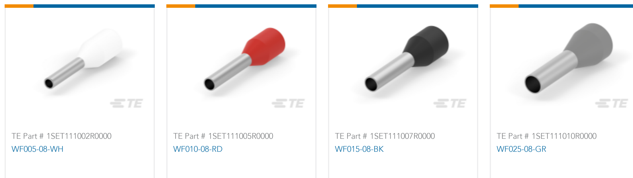
TE Part # 1SET111002R0000 WF005-08-WH