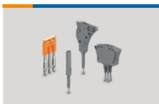
Terminal Block & Strip Conducting Accessories(67)