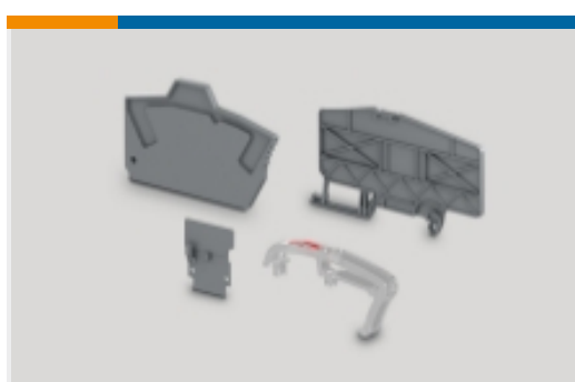
Terminal Block & Strip Insulating Accessories(31)