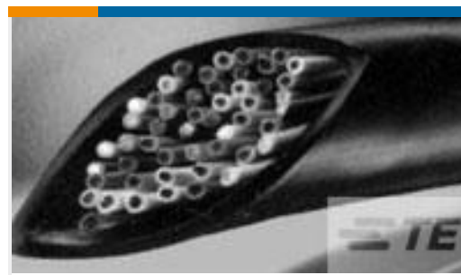
TE Part #F24044-000 NT-MIL-3/8-0-SP