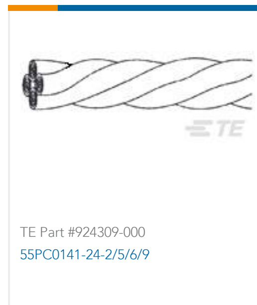
TE Part #924309-000 55PC0141-24-2/5/6/9