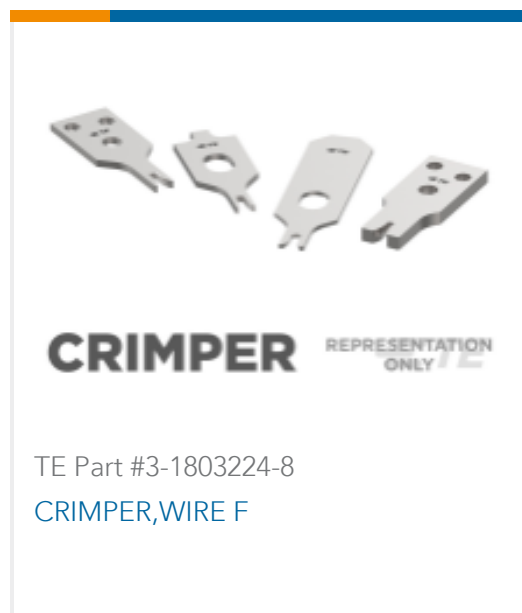
TE Part #3-1803224-8 CRIMPER, WIRE F