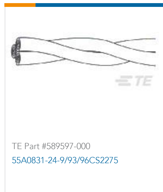
TE Part #589597-000 55A0831-24-9/93/96CS2275