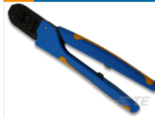
TE Part #2844982-1 CCII TYPE VI MLTIMATE PIN/SKT 22- 18 ASSY