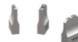
ANVIL REPRESENTATION ONLY