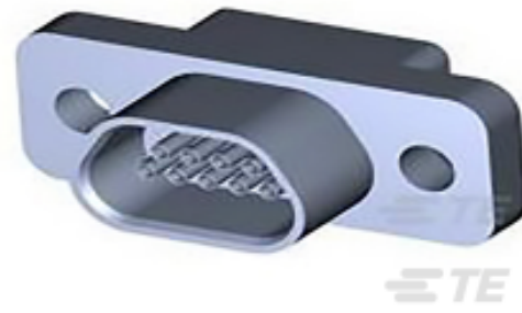
TE Part #1532177-1 M83513/04-G01N, MCKS-N1-B- 51S6G1-18.0