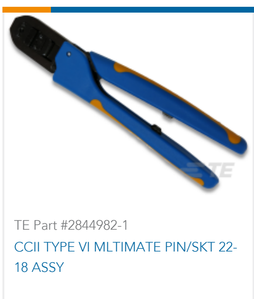
TE Part #2844982-1 CCII TYPE VI MLTIMATE PIN/SKT 22- 18 ASSY