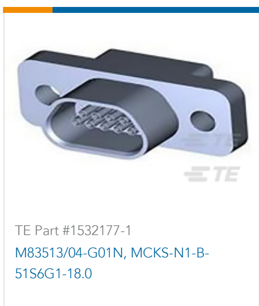
TE Part #1532177-1 M83513/04-G01N, MCK5-N1-B- 51S6G1-18.0