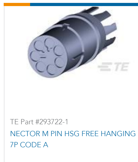
TE Part #293722-1 NECTOR M PIN HSG FREE HANGING 7P CODE A