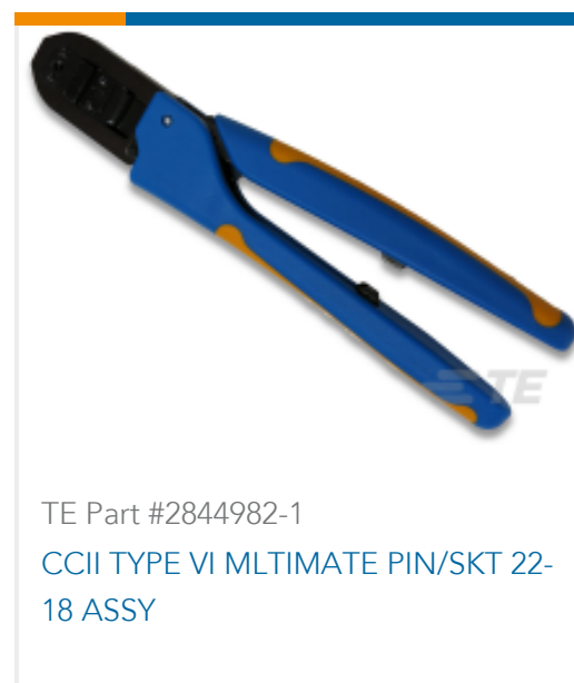
TE Part #2844982-1 CCII TYPE VI MLTIMATE PIN/SKT 22- 18 ASSY