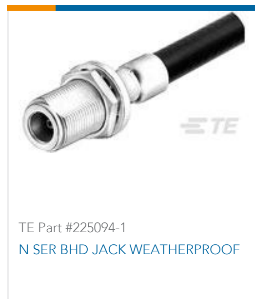
TE Part #225094-1 N SER BHD JACK WEATHERPROOF