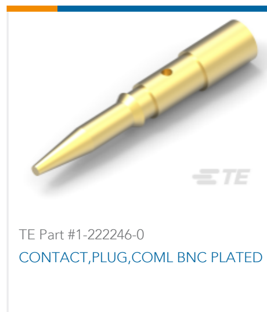
TE Part #1-222246-0 CONTACT, PLUG, COML BNC PLATED