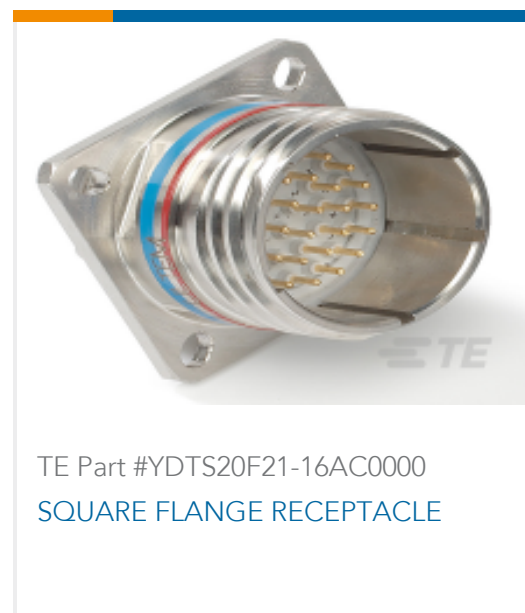
TE Part #YDTS20F21-16AC0000 SQUARE FLANGE RECEPTACLE