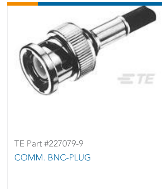
TE Part #227079-9 COMM. BNC-PLUG