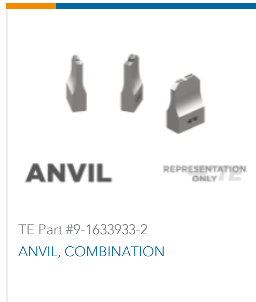
TE Part #9-1633933-2 ANVIL, COMBINATION