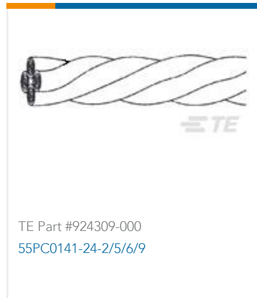
TE Part #924309-000 55PC0141-24-2/5/6/9