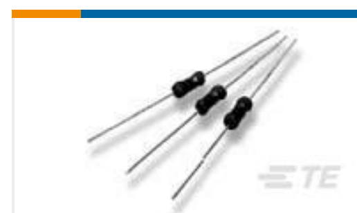
TE Part #2-1879351-7 RR01 5% 36K AMMO