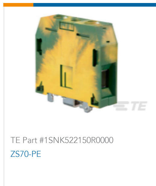
TE Part #1SNK522150R0000 ZS70-PE