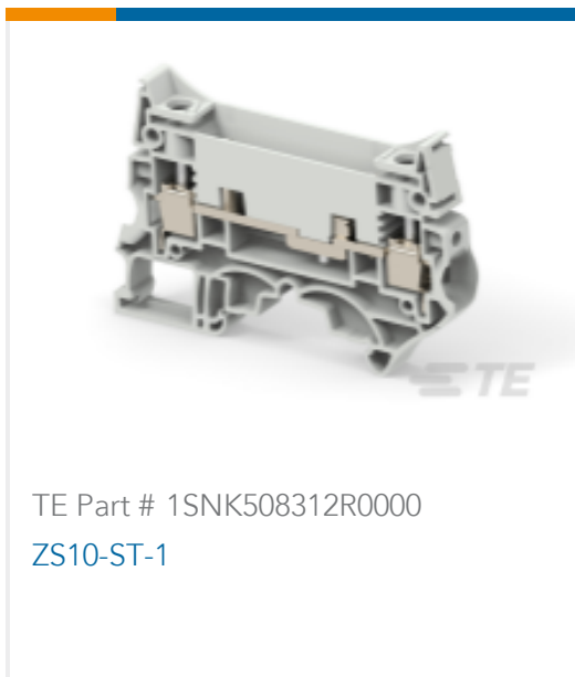
TE Part # 1SNK508312R0000 ZS10-ST-1