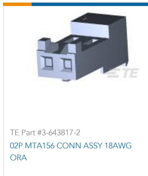
TE Part #3-643817-2 02P MTA156 CONN ASSY 18AWG ORA