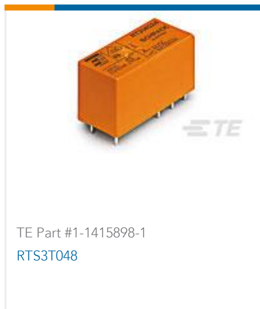
TE Part #1-1415898-1 RTS3T048