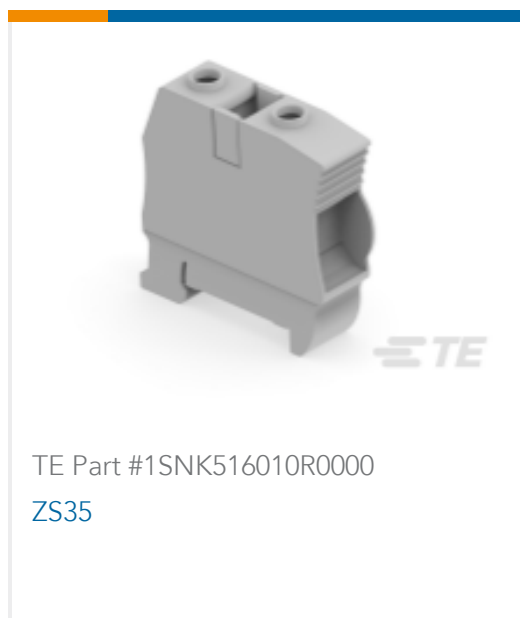
TE Part #1SNK516010R0000 ZS35