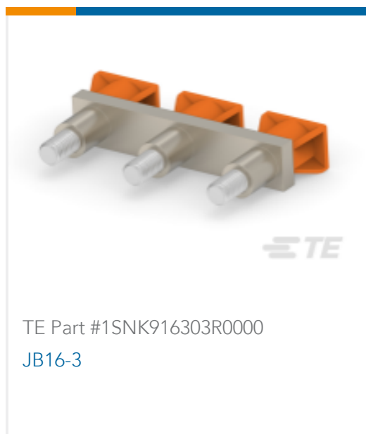
TE Part #1SNK916303R0000 JB16-3