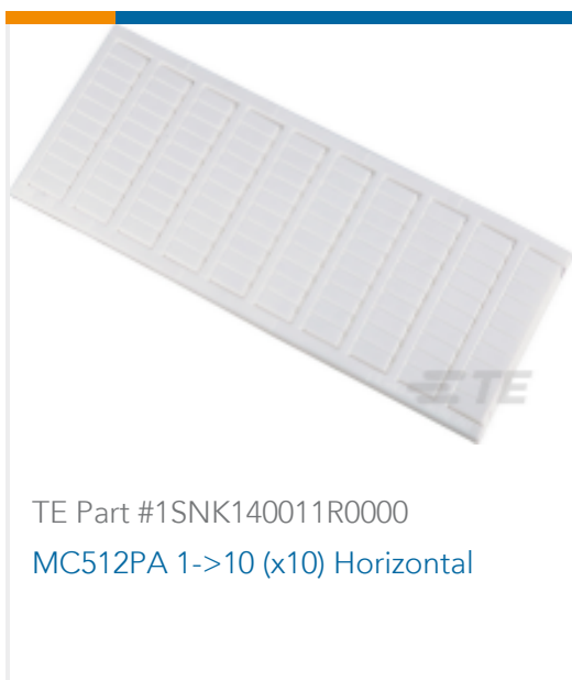
TE Part #1SNK140011R0000 MC512PA 1->10 (x10) Horizontal