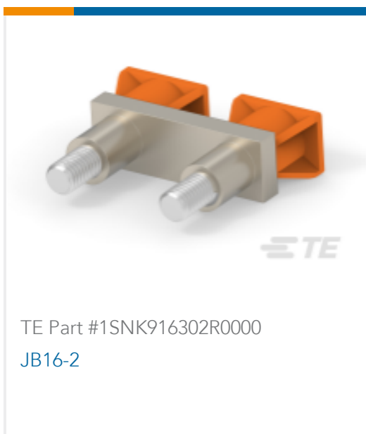
TE Part #1SNK916302R0000 JB16-2