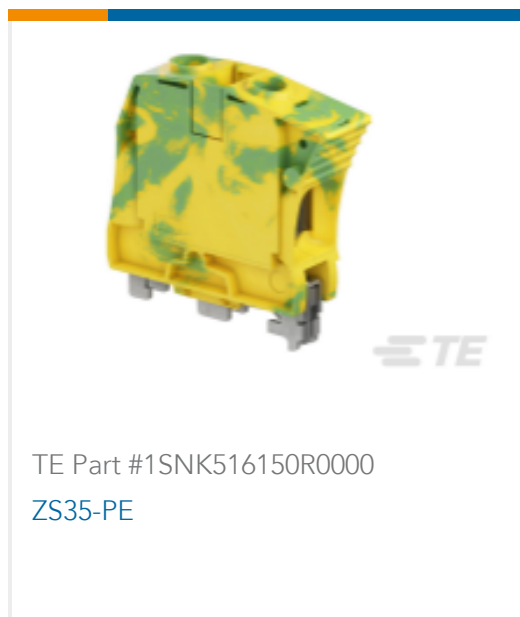
TE Part #1SNK516150R0000 ZS35-PE