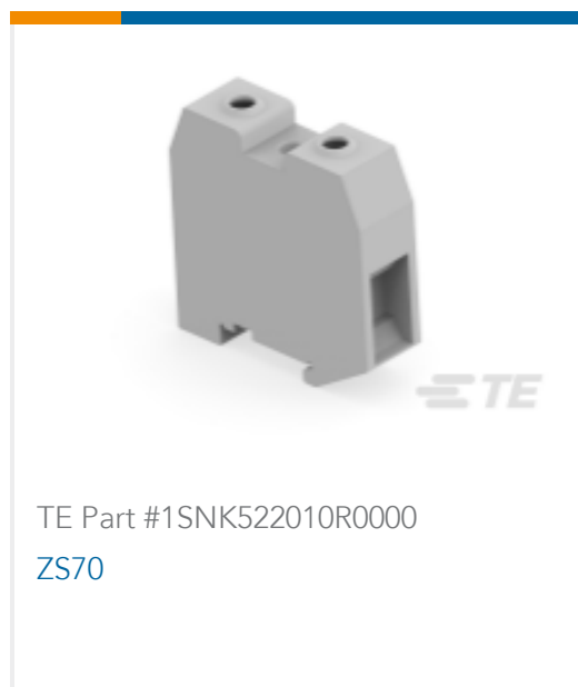
TE Part #1SNK522010R0000 ZS70