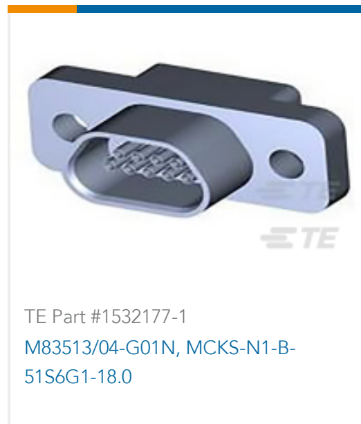
TE Part #1532177-1 M83513/04-G01N, MCKS-N1-B- 51S6G1-18.0