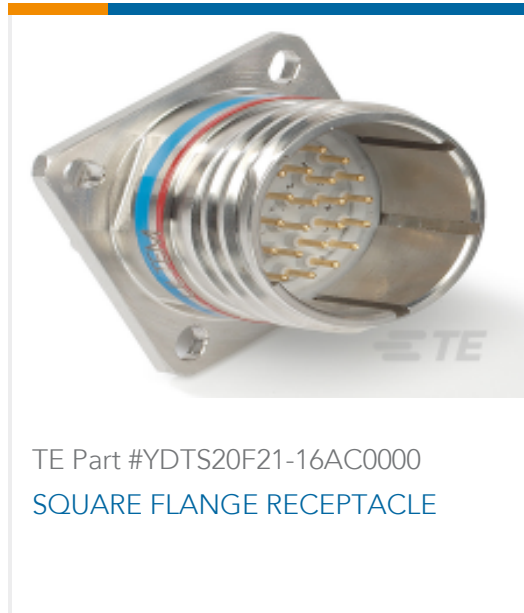
TE Part #YDTS20F21-16AC0000 SQUARE FLANGE RECEPTACLE