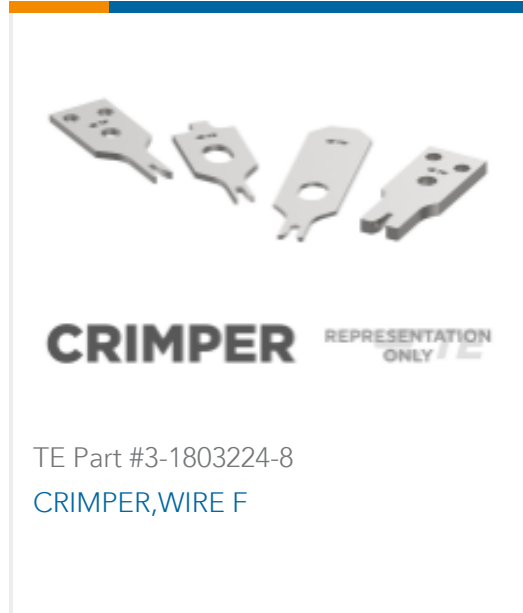
TE Part #3-1803224-8 CRIMPER, WIRE F