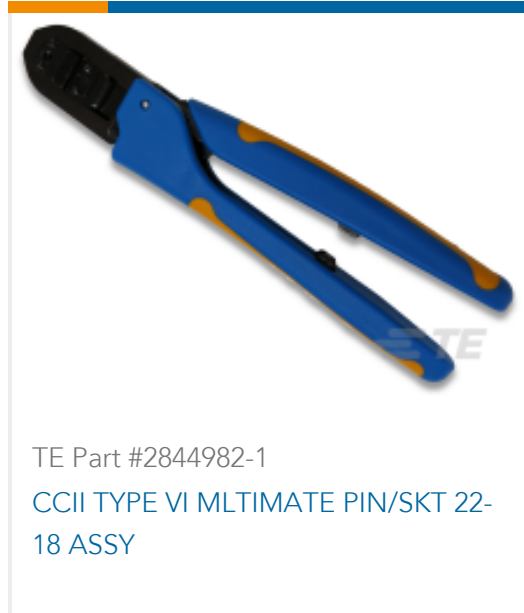
TE Part #2844982-1 CCII TYPE VI MLTIMATE PIN/SKT 22- 18 ASSY