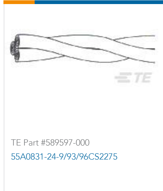
TE Part #589597-000 55A0831-24-9/93/96CS2275