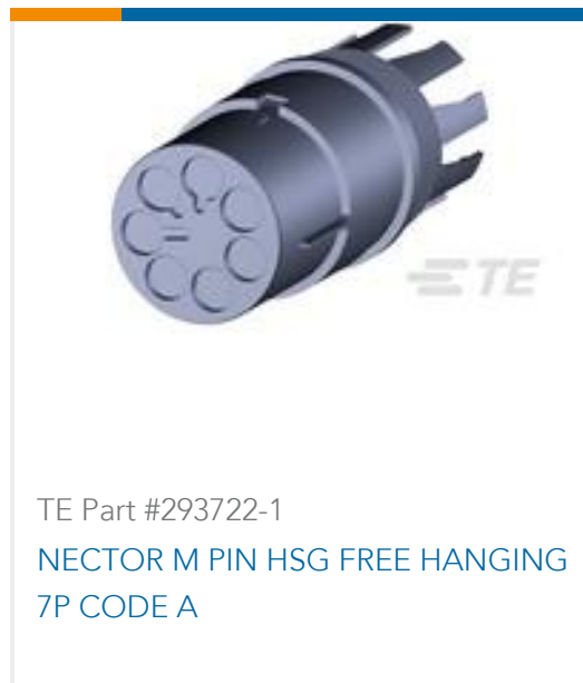
TE Part #293722-1 NECTOR M PIN HSG FREE HANGING 7P CODE A