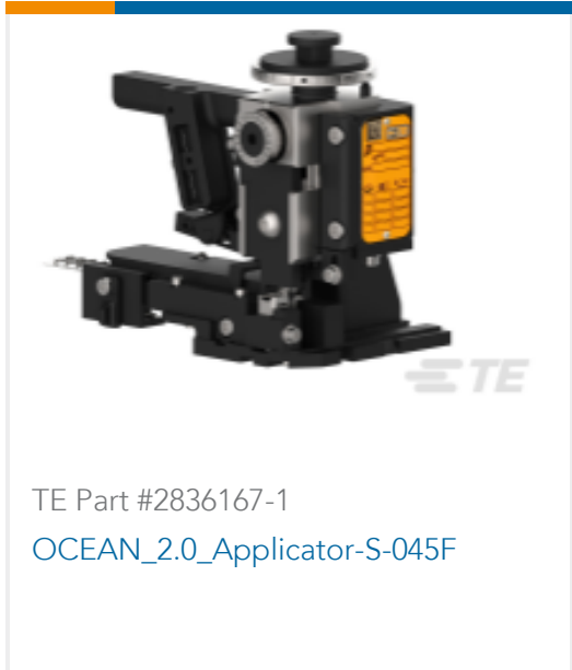
TE Part #2836167-1 OCEAN_2.0_Applicator-S-045F