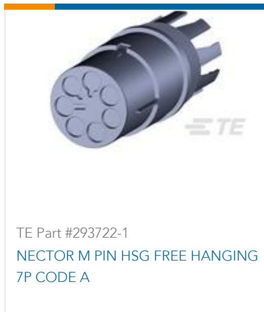
TE Part #293722-1 NECTOR M PIN HSG FREE HANGING 7P CODE A