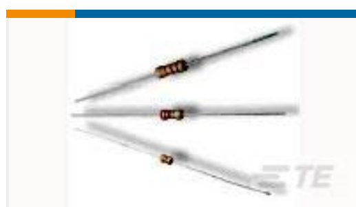
TE Part #2-1623928-8 CFR16 5% 4K7