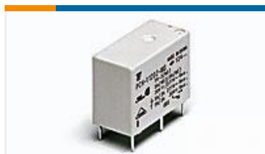
TE Part #1440004-1 PCH-124D2,000